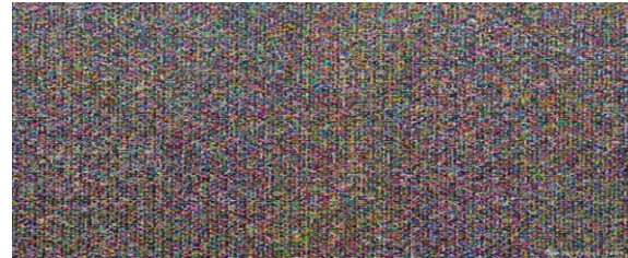
Fig. 3. Chinese abstract artist Ding Yi's "Appearance of Crosses" series of works 1.

space also shows more richness and structural levels due to the changing rules, it can still be summarized as the continuous repetition of simple cross-shaped elements. In this seemingly single but richly constructed schema (See "Fig. 4"), Ding Yi insisted on using simple schema elements to construct a large number of conceptual fragments, which connect the artist's inner mapping. Through the time deduction of the cross-shaped series and the persistence of reason, it demonstrates its inner philosophical understanding.