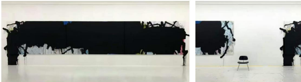
Fig. 1. Tan Ping's 2016 exhibition work of "Mountains Beyond Mountains" at Helmhaus Art Museum in Switzerland.

the narrative features of the work through the interweaving of blocks, lines and colors in the painting: on the one hand, some picture elements are hidden, eliminated and superimposed; on the other hand, more new elements and new narratives are covered and superimposed, presented and accepted, constructing a richer semantic and metaphorical nature. "Typical metaphors involve not only changes in scope, but also changes in domains".[3] This feature of schema transfer continued into Tan Ping's solo exhibition "Stitching and Regeneration: From Zurich to Basel Hong Kong" at the 2018 Hong Kong Basel Art Fair Insights Asian Vision Unit. The lines and shapes in the picture of the work began to "overflow" to the wall of the exhibition hall, expanding the new spatial vision and dialogue relationship. This dialogue relationship exists not only between the content overflowing inside and outside the screen, but also in the multiple contexts formed by the works people and the exhibition space, forming the viewing logic and schema outside the field and in the vision and giving birth to a rich and connotative metaphorical spiritual realization.