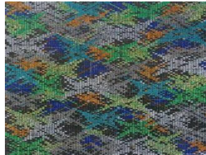
Fig. 4. Appearance of Crosses 2017-6.

"The characteristic of art is that art is a language with all possible levels of understanding".[6] For Goodman, the viewing and understanding of abstract paintings is also a "schematic interpretation of the characteristics of images obtained metaphorically". In this process, both the atmosphere presented by the painting as a whole and the details in the picture refer to the whole as one with the work. The abstraction of an artist's work of art has never been achieved overnight, and often requires a long creative process. The German artist Richter's mid-term paintings have changed the image from visualization to the appearance and obliteration, and have undergone many changes. In the photorealistic painting of the early 1960s, Richter put more photographic features into his paintings as much as possible. In the 1970s, Richter began to randomly choose unintelligibility, visual fragments and external tones and scenes as various heterogeneous graphical elements in the picture, used seemingly irrational presentation methods to transform the visual experience into a specific form of intention and then through the destruction and covering of tools and paints, formed new patterns and constructed meaning. Richter mapped