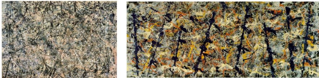
Fig. 2. The work of American abstract artist Pollock.

the indescribable feeling and emotional nature".[4] Here, "What distinguishes metaphors is the novelty and instability". In the schema of Pollock's works, the interweaving and superposition of line-like shapes present intense emotions, real confusion, and inner struggle. Bart's fable schema thinks that the first layer of the image is informative and referential, and the second layer is symbolic. Although the works of both artists include "action painting", Tan Ping's paintings show more traces of thinking, internalized faints, and the construction of perception.