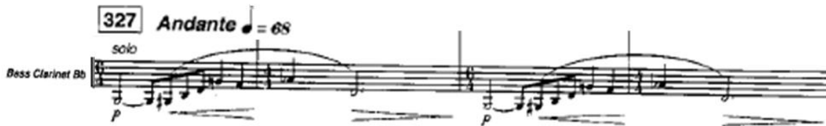
Fig. 2. Concerto for Wind Orchestra "Vjenne" .

The methods of theme development are rather traditional: selecting the motif, sequencing, undulating evolution, polyphonic techniques of work (most frequent in Hidas's work). In a similar way, the author