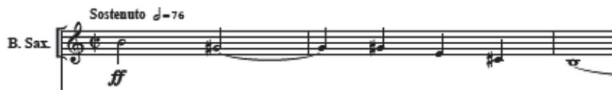
Fig. 5. The Undanced Ballet. Movement I.

The impression is produced that the composer rejects "novelty" in favour of the familiar and understandable, as well as the principles of postmodern irony and cynicism in favour of sincerity as the main motif. There Hidas comes into contact with the artistic trend of "new sincerity", representatives of which aimed at recovering "lost purity" and addressing the problems of "a non-exclusive person in a non-exclusive state" [11].