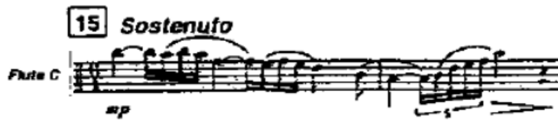
Fig. 4. The Second Concerto for Flute and Wind Orchestra. M. 15.

However, with the development of the theme, such stylistic characteristics are found that associate with Slavic melodiousness rather than with the Asian one. This is primarily due to the initial pentatonic series being replaced by a natural tone (m. 13). It is also important to highlight that the mode transformation, which ensures the generic shift in Hidas's compositions, can be implemented through gradual "Europeanization" and vice versa.