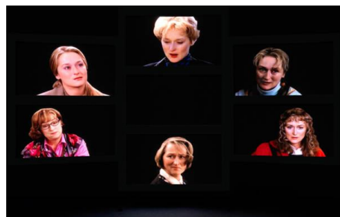
Fig. 1. Candice Breitz, "He and her 1968-2008".

The artist who is keen to express "the view of inner time" is Bill viola. In his image works, the body is a living medium. For example, in 1992 "Nantes triptych" was composed of images of three screens. Synchronicity presented the process of life from birth to decay. Time is fixed in two images of the baby and the old woman to complete the self-body reference under the theme of life and death. The video installation work created by South African female artist Candice breitz "he and her: 1968-2008" ("Fig. 1"), in which the actress is Meryl street and the actor is Jack Nicholson. The device is respectively played in two connected rooms, and each part is composed of seven small screens. The artist tries to test "human nature" with the lens. In the simple background, the actors are cut out from different movie segments, and the changes of people's spiritual outlook and living conditions in the past 40 years are interpreted by different personality traits. The two actors form a kind of tension on the play, which realizes the synchronic presence in the diachronic space.