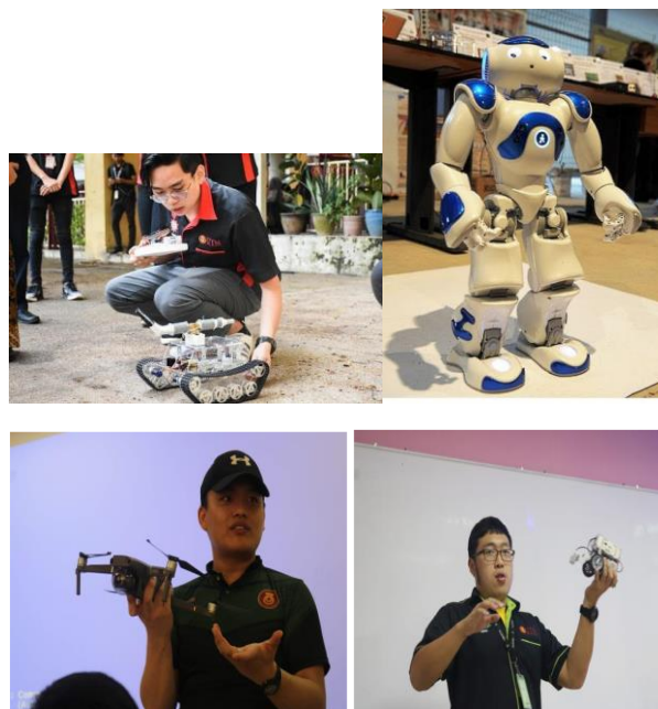
Figure 2 Sharing IOT experience and knowledge by MJIIT students

Combining these two strong value-added of MJIIT, the new CEE program has gone beyond traditional learning. In this sense, students will gain more interactive and real IoT experience which enhances understanding where understanding leads to more creative and innovative thinking.