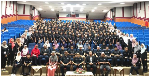
Figure 5 First batch joining this MJIIT CEE program.

The closing ceremony of the CEE @ MJIIT UTM–IMTIAZ was officiated by YB Datuk Seri Mohd Redzuan bin Md Yusof, Minister of Entrepreneur Development, at the Azman Hashim Hall, Universiti Teknologi Malaysia Kuala Lumpur.