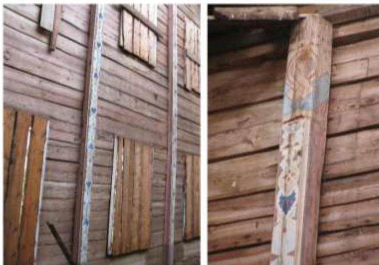
Fig. 5. Vertical compresses in the interior of the Church of the Vladimirskaya Icon of the Mother of God, 1795 (1882) in the village of Demidovskoye (Nizhnyaya Puya).

reinforced with vertical walls due to its height and large cut through windows and covered with painted canvas ("Fig. 5").