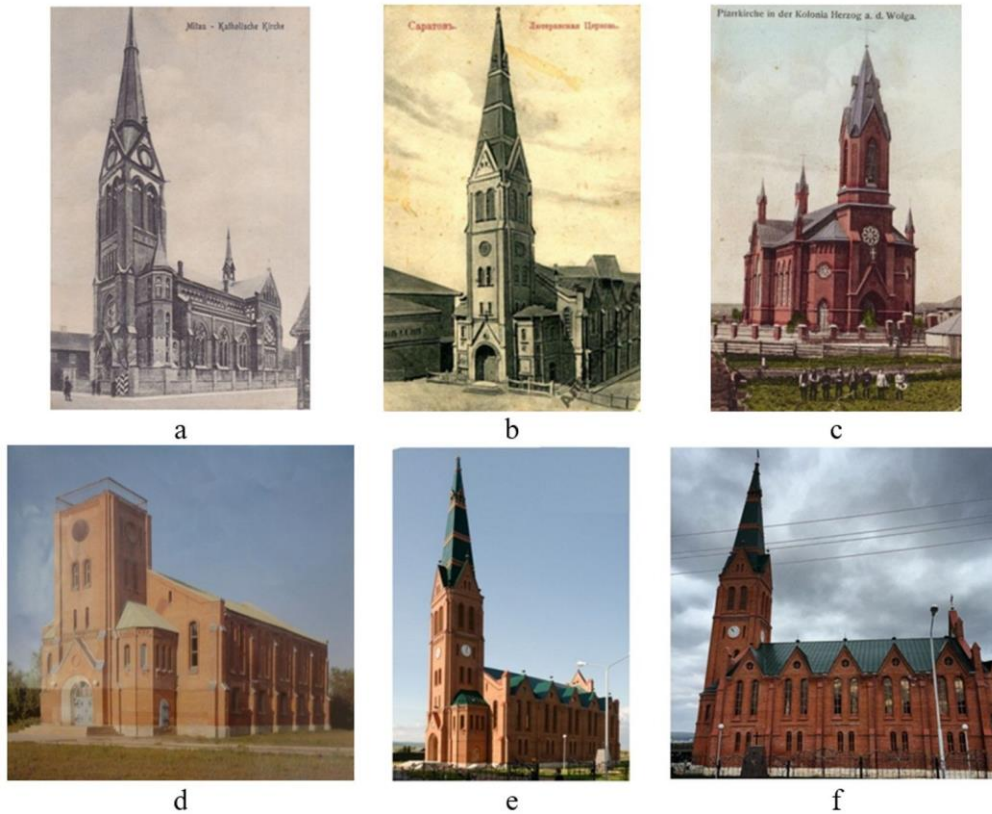
Fig. 2. a – Mitau, b – Saratov, c – Susly (Herzog), d–f – Zorkino (Zürich).

The Church of St. Mary in Saratov became a model for the Protestant church in Tsaritsyn. By the way, initially, the Protestants of Tsaritsyn were served by herennhutters from Sarepta. Only in 1894, an independent parish has been formed here. The Lutheran Church was built in Astrakhan, following the example of the Church in Saratov.