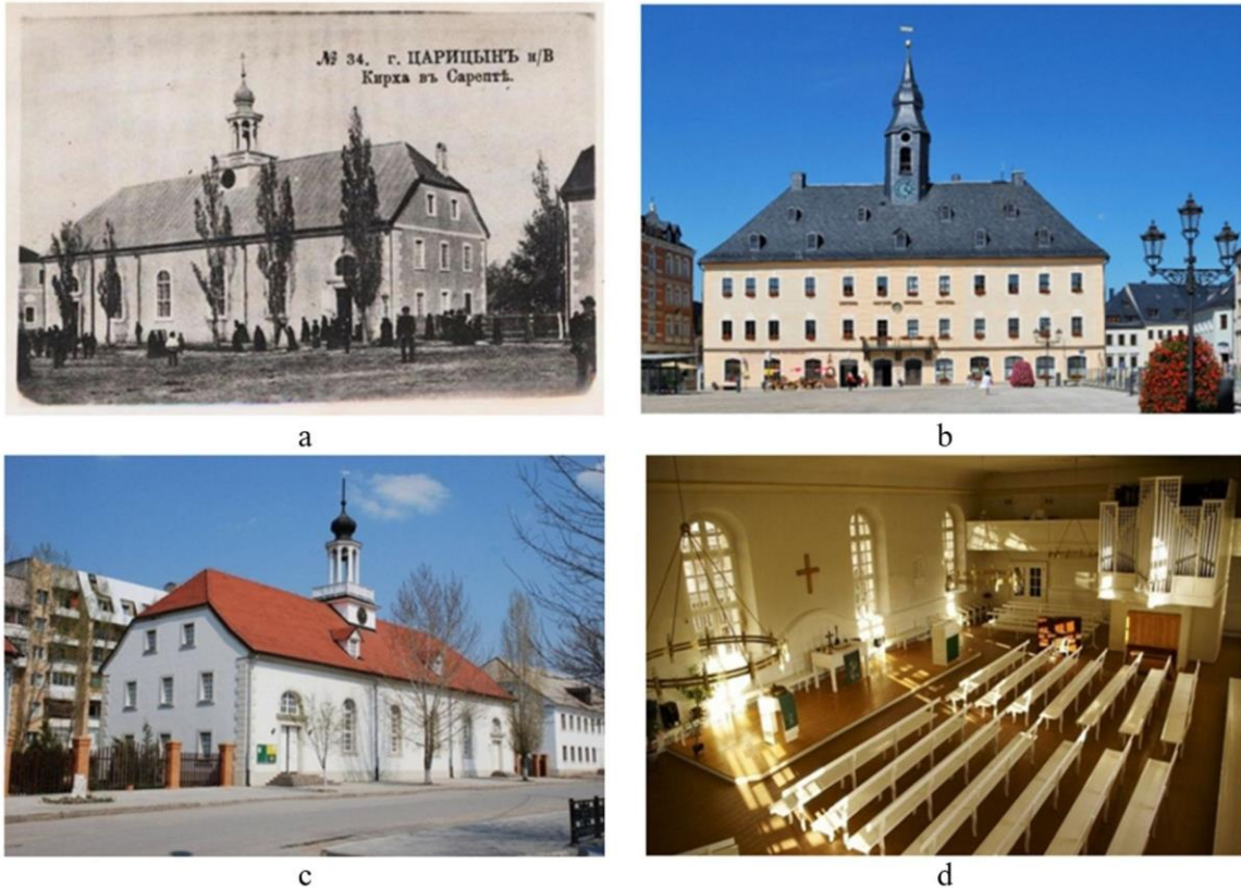
Fig. 1. a, c, d – the Church in Sarepta, b – Town Hall (Annaberg, Germany).