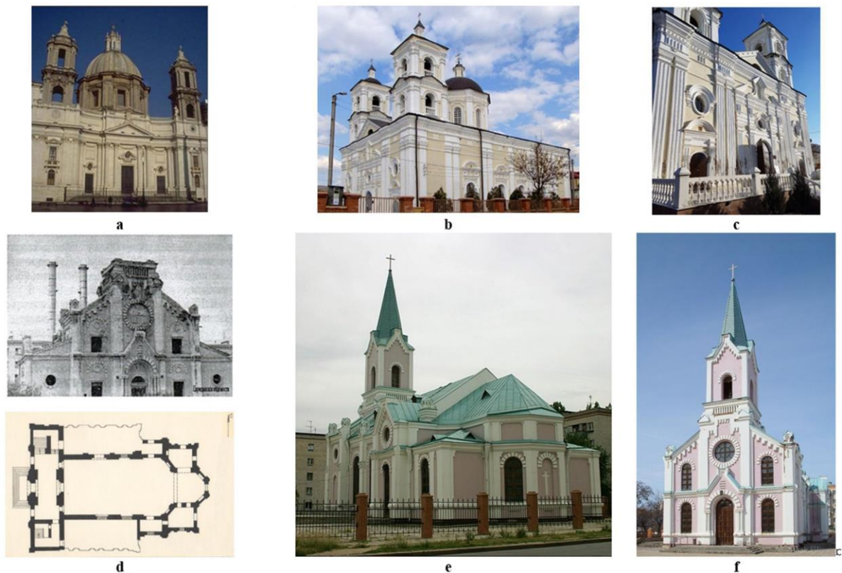
Fig. 6. a, b, c – Astrakhan, d, e, f – Tsaritsyn.

The Tsaritsyn (Volgograd) parish was part of the Saratov diocese. In 1898, 430 Poles lived in Tsaritsyn. A Cathedral was built in 1899. The technical-construction committee of the Ministry of Internal Affairs applied for permission to build the Cathedral, enclosing the design drawings. The design was rejected and replaced with the design drawings for the Cathedral in Plock [6]. The façade structure of the Tsaritsyn Cathedral is close to that of the Cathedral of St. Bartholomew in Plock (1730s) and is in the Baroque style. Although the architecture of the Tsaritsyn Cathedral closely resembles the Romanesque style, there are also elements of the Baroque style. The Cathedral is of the hall-type with its belfry on the main façade vertically articulated with buttresses. The decor is centered on the main façade. ("Fig. 6")