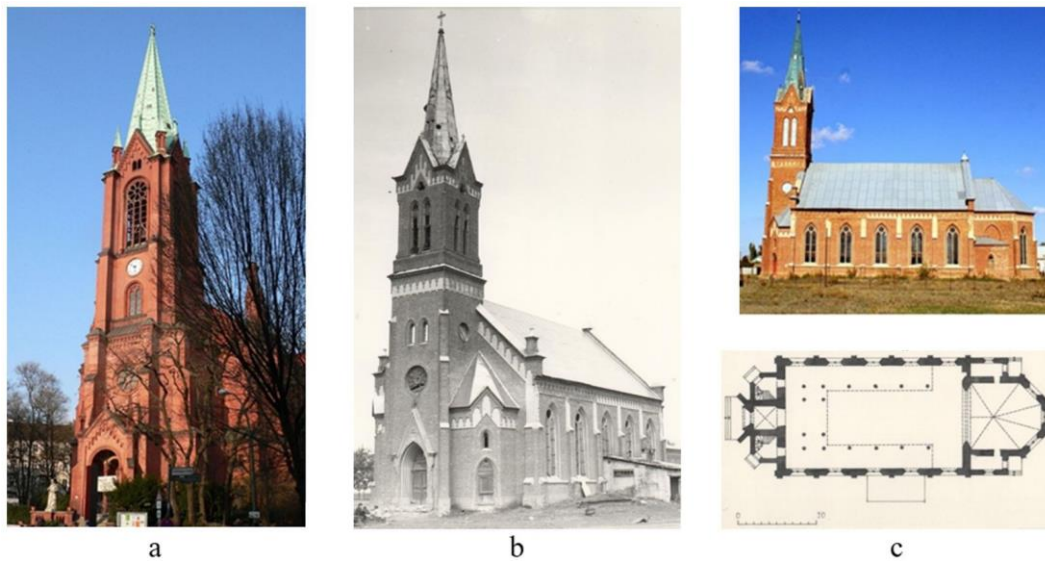
Fig. 3. a – Emmauskirche (Berlin), b, c – Verkhny Yeruslan.