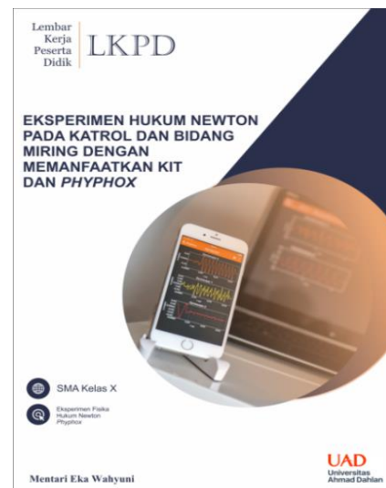
Figure 3: Student worksheet design

experiment, tools, and materials, experimental procedures, data analysis, conclusions, and questions. The development phase is to improve the worksheet products that previously made. Through the use of guided inquiry models and smartphones as experimental devices integrated into the student worksheet, innovation was made in products. Sensor-based applications on smartphones help students detect physical quantities such as acceleration in the subjects of Newton's Law [29]. This measurement can be done easily through application assistance on smartphones[30]. In the student worksheet that was developed, the researcher explained the application of phyphox as an acceleration sensor.