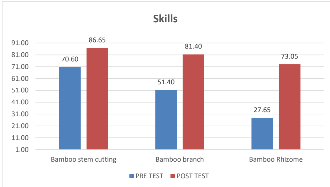
Figure 2 Descriptive test of community performance in riverbank conservation

The detailed test results are presented in figure 2.