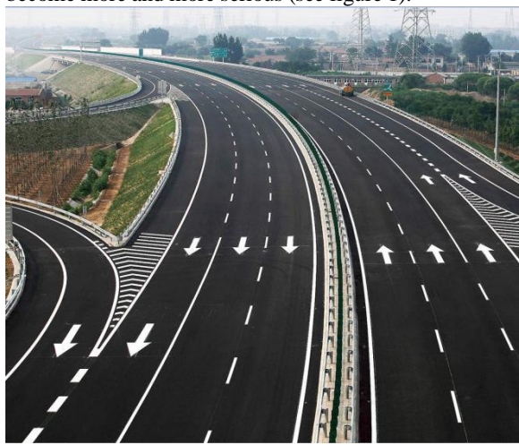
Figure 1. The smoothness of Expressway Pavement

number of private cars is increasing gradually. Many people like to travel by car. Every legal holiday, the phenomenon of highway congestion appears frequently. On this basis, the phenomenon of highway damage will become more and more serious (see figure 1).