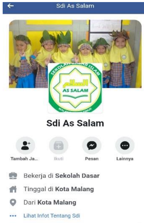
Figure 2 School Social Media