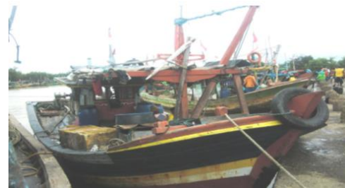
Fig. 2. Cantrang ship.

This research was at Kenjeran Beach, Kenjeran Subdistrict, Surabaya City. Cantrang fishing gear included in the classification of circumferential bag trawl consists of net bag, net body, wing, buoy, ballast, top rope, and bottom rope. Cantrang boats are made of wood, usually teak wood; tamarind wood; or johar wood. Cantrang ships use diesel fuel with a peak season requirement of 300-600 liters, while in the dry season it only requires around 30-90 liters of diesel. Cantrang boats are equipped with hatches, to store fish catches of 3m in length, 2m in width, in 2m (fig. 2).