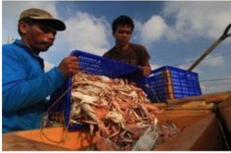
Fig. 4. Catching crab and crab fish.