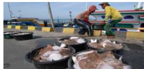
Fig. 3. Catching of pari fish.

The catch of fishermen from Kenjeran Beach, Kenjeran District, Surabaya City is Keting, Pari, Rajungan, and Crab (fig. 3 and fig. 4).