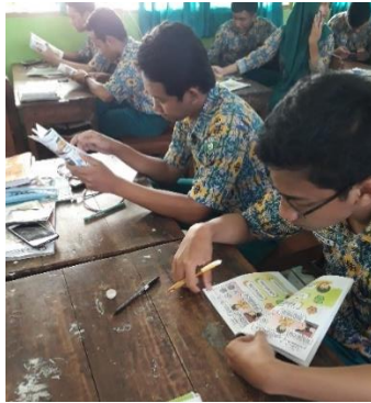
Figure 3 Limited Trial Test

The student learning outcomes improvement can be calculated from the pretest and posttest scores, the pretest and posttest questions are given to 12 students when the limited trial test is conducted as in Fig. 3.