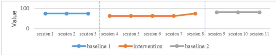
Figure 1 Acquisition of Soft Motoric Capability Research Result B.

68.75%. At baseline-2 conditions showed results with a value of 87.5% in the tenth session and 93.75% in the ninth and eleventh session, this value is higher than the value at the baseline-1 condition, the highest value is 87.5% and the value the lowest is 81.25%. During baseline-1 to baseline-2, M has increased.