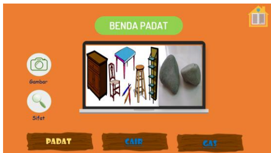
Figure 2 The Material in Interactive Multimedia

This interactive multimedia is equipped with instructions for teachers and students to make it easier to use. Instructions for use for teachers are arranged in print out form, instructions for teachers contain guides for teachers in carrying out learning using interactive multimedia.