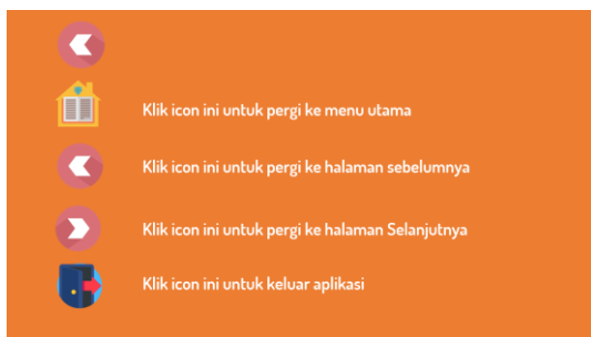
Figure 1 Instructions for Use

From the substance of the structure, this interactive multimedia product includes descriptions, materials, examples/applications, questions and answer keys, games, instructions for use which are all presented audio-visual. Third, from the substance of the display, this interactive multimedia product is developed in such a way as to attract the attention of third-grade elementary school students. In addition, the development in terms of appearance also pays attention to the psychological-aspects of children aged grade III SD.