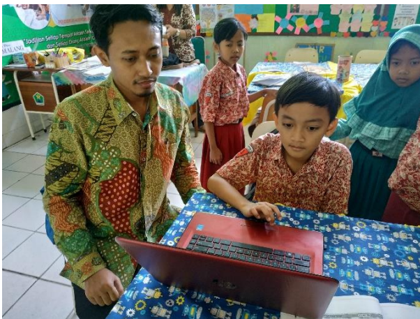
Figure 4 Product trials

Limited group trials were conducted on 5 students who were randomly selected (Figure 4). The trial was carried out during recess so as not to interfere with the teaching and learning process. The trial was carried out using 1 laptop with an alternate use. Researchers assist students in operating interactive multimedia. Students are said to be easy to operate interactive multimedia if at the time of operating this multimedia students are fluent and do not ask researchers about how to use it. Students are said to have difficulty operating this interactive multimedia if students look long in operating multimedia and often ask researchers how to use it.