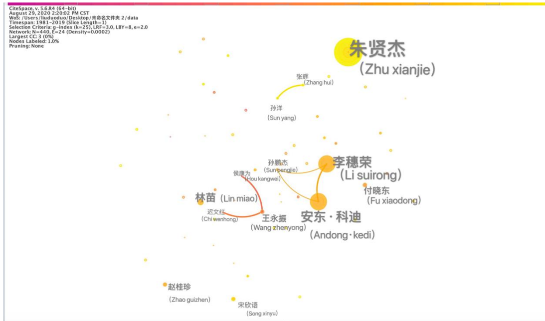
FIG.2 The authors cluster the knowledge map