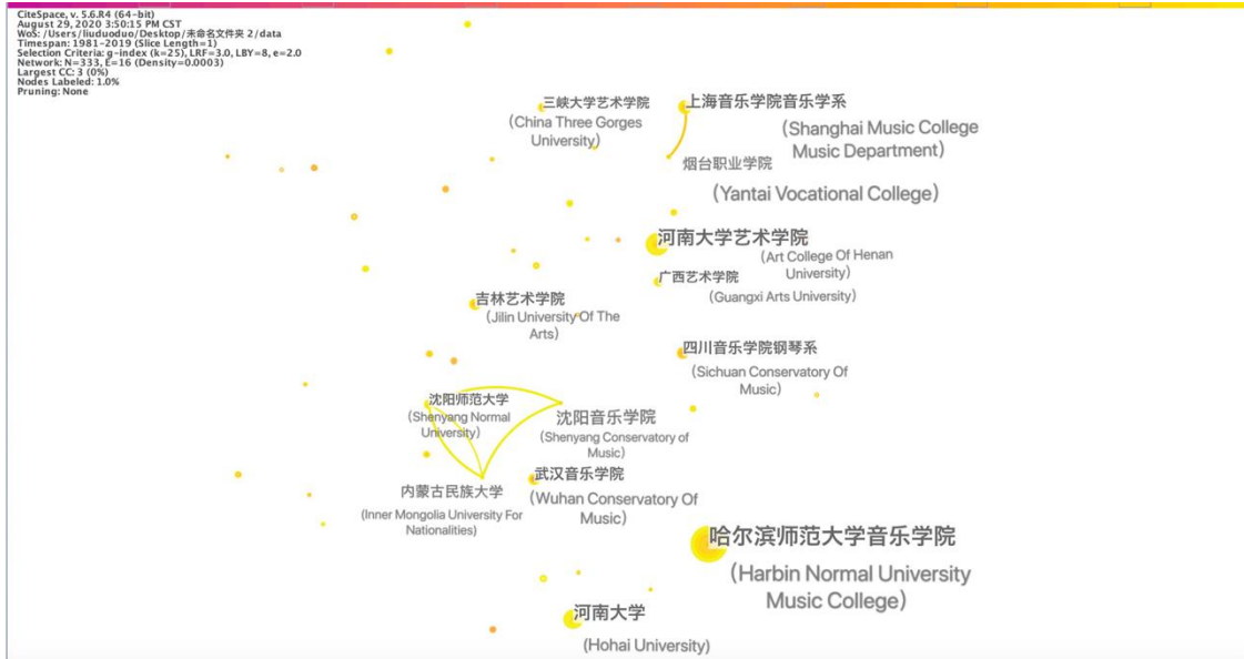
FIG. 3 Cluster knowledge map of issuing institutions