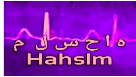
Fig. 3. Heart Praise [13]

Then for the right atrium (right porch) serves to receive blood rich in carbon dioxide and then circulated to the right ventricle (right ventricle). Then this is where the function of the right ventricle (right ventricle) is to drain the blood to the lungs or commonly called the "small blood circulation". Such is the description of the analysis of the picture above, that the blood circulation in the human heart has been in a very neat and structured arrangement. It all happened Because of the power of Allah SWT. By the concept of Hahslm, our heart can function optimally with the aim that we can perform daily life activities and most importantly we are created by Allah SWT to worship Him.