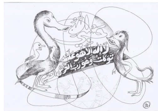
Fig. 3. Third Step: Adding text in the form of holy verses of the Qur'an, Prophetic Hadith, Arabic Poetry, Pribahasa, or Aphorisms in the form of advice and advice.

3) Simply calligraphy means beautiful writing: The type of calligraphy that is displayed consists of various Arabic script characters, Latin script and regional characters (Bugis-Makassar script, Javanese script, Batak, Lampung, etc.). Arabic script or Arabic calligraphy is often called Islamic calligraphy (see figure 3). Even the public's perception that calligraphy is the connotation of Islamic calligraphy. In Islamic calligraphy itself there are various types of letters, among others; Khat Naskhi, Sulus, Diwani, Diwani Jali, Riq'ah, Farisi and Kufi . In addition to various types of khat that have reached the standard and standard stages, there are also types that take the name of the character or the nature of the letter itself. At present the author has recorded a variety of calligraphy characters containing 12 characters, namely: Character of Fire, Water, Sharp, Fat, Skinny, Rope, Bamboo, Folds, Beams, Chess Boards, Leaves, and Fish Characters. Various character letters are found in the book: "The Variety of Islamic Calligraphy Characters: Peeling Out the Complete Calligraphy of Expression". Exemplified in this article Fat Character .