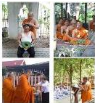
Fig. 4. Shows the Participatory Data Collection by the researcher to ordained as a Buddhist monk.

The second step, Participatory Data Collection method collect by the researcher to ordained as a Buddhist monk with himself at Panyanantaram temple in Patumthani province and Suandham Angthong to study the lifestyle and religious activities of Buddhists monks in 15 days. The research instrument is activities photographs, as shown in Figure 4. Data interpretation was use by Content Analysis technique.