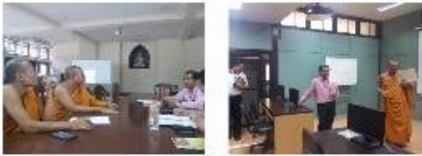
Fig. 3. Shows the Data collection with the Panyanantaram temple Administrative Committee.

The first step is the qualitative data collection by the Executive in-depth interview technique. The population is the Panyanantaram temple administrative committee by the Purposive Sampling method. Data interpretation was used by the Content Analysis method. Data collection instruments are the Executive in-depth interview form and the photographs, as shown in Figure 3.