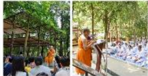
Fig. 2. Shows the monks sermonizing with the people.

Some Buddhist monks usually sermonize Buddha's story, Buddha's words, virtues in everyday life to guide the people to get a good experience in the way of Buddhists, as shown in Figure 2.