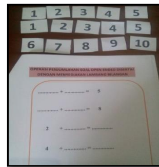
Fig. 4. The Example of open ended questions with picture of numbers

Researcher rechecked their understanding of the concepts of addition and subtraction by delivering a matter of addition and subtraction in the form of open-ended questions, but it was completed with pictures of numbers that could be used by the subjects to pair the appropriate number in the question (Figure 4.). But this apparently did not produce results. Students who were able to solve this question has not increased which was only 6 students who were able to finish it out of 21 students.