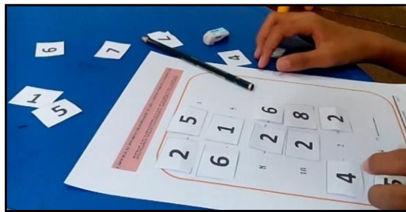
Fig. 1. Open-ended question with the images of numbers

At level 4, namely the ability to add and subtract open ended questions along with image of numbers to be paired to form the correct operation.