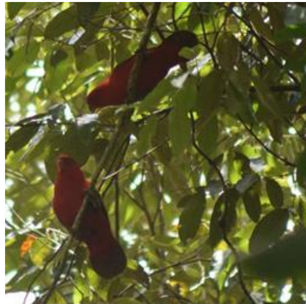
Figure 3 Chattering Lorry ( L. garrulus )

family found are included in the list of IUCN (The International Union for Conservation of Nature), there are two species of birds that are included in the vulnerable category (Vulnerable; VU), namely White cockatoo ( C. alba ) and Chattering lory ( L. garrulus ) and seven other types including the low-risk category (Least Concern; LC).