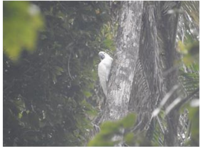
Figure 4 White Cockatoo ( C. alba )

Riparian site ecosystem Tukur - Tukur found six species of Pssitacidae, namely White Cockatoo ( C. alba ), Chattering Lory ( L. garrulous ), Eclectus parrot ( E. roratus ), Violet-necked lorry ( E. squamata ), Moluccan king-parrot ( A. amboinensis ), and Red-cheeked parrot ( G. geoffroyi ). The riparian area of the Tukur site - Tukur has a relatively flat characteristic around a hill with a shallow rocky river flowing in a valley with open vegetation. The species found are similar to those in lowland forests; the same dominating bird is Chattering lory ( L. garrulous ) and Red-cheeked parrot ( G. geoffroyi ). Species that do not predominate in the riparian ecosystem are Tukur - Tukur, namely the Moluccan king-parrot ( A. amboinensis ), White Cockatoo ( C. alba ), and Violet-necked lorry ( E. squamata ).