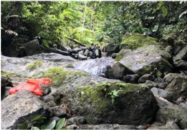
Figure 5 The riparian ecosystem in Beringin Lamo

Based on the four observation sites conducted with the same two ecosystems, the Tukur-Tukur site found more species of Pssitacidae compared to the Beringin Lamo site. The condition of the abundance of feed is the main factor determining birds' presence in a place. The abundance of feed will affect bird species' presence and their ability to adapt to a location to create separate niches to meet their needs. Site characteristics Measures - Relatively flat gauges with sufficiently open vegetation and bird feed availability are factors in the species of Pssitacidae that are found more than the Beringin Lamo site.