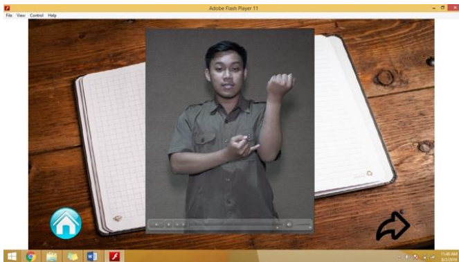
Fig. 3. The display of instructions (questions) in sign language.

Development of intelligence test media for children with hearing impairment adapted the WISC intelligence test. The adaptations made are as follows.