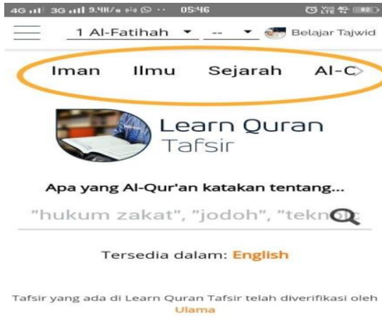
Figure 2. The themes in the Learn Qur'an Tafsir Application