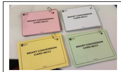
Fig. 2. Flashcards used in SCC tool.