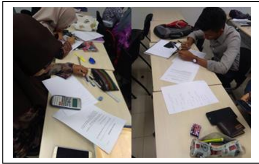
Fig. 4. Students show their method of performing unit conversion before and after using SCC tool.