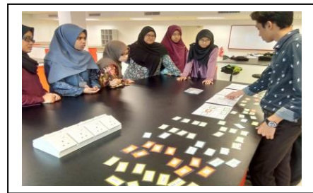
Fig. 1. Demonstration of using SCC tool to the students.