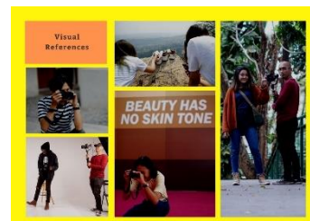
Figure 3 An example of real future employment pictures as the visual modes.

In addition, pictures capturing real future employment in the field of Multimedia could be provided as the visual modes of the textbook. The example could be seen in Figure 3.