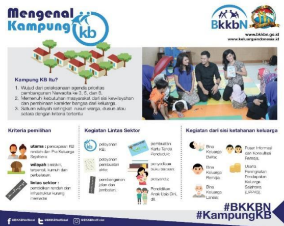
Fig. 2. The introduction of Kampung KB.

Some of the inter-sector integrated services that are the needs of the Cigadung community, for example, such as family planning services, posyandu services, population administration services (KK revisions, making ID cards or KTP), provision of reading gardens, and other services. These are activities carried out as a result of the identification of needs in the community. The introduction of Kampung KB can be seen on figure 2 bellow.