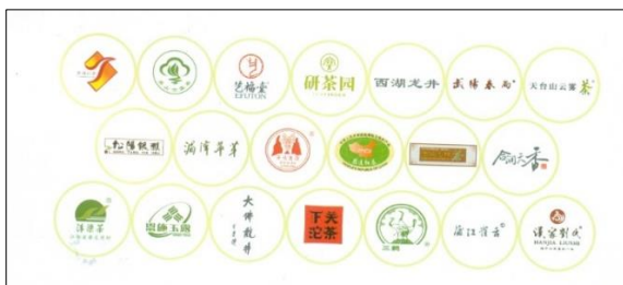
Figure 5: Different famous brands of tea in China

China Tea Brand Hall displays tea produced in more than 21 provinces by more than 80 million farmers in China. This hall demonstrates the most famous brands of tea with their geographical regions stretched in the different periods of China’s history.