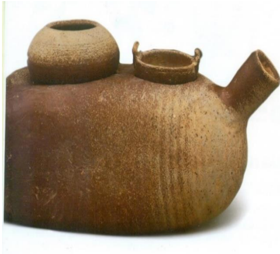
Figure 1: Ancient time tea presetting stove from the Han dynasty

In the Tea category hall, there are displayed samples of about 100 kinds of tea. The most prominent among these tea categories are green tea, black tea, oolong tea, yellow tea, white tea, and dark tea. This variety of teas illustrates Chinese people's love for tea. The tea information hall provides information teaspoons and practical guidance about the cultivation, and presentation of tea. Tea sets hall exhibits hundreds of various kinds of tea utensils including teapots, teacups, tea trays, tea storage boxes, tea grinds, teaspoons, tea measures, and many others from Wei, Jin, Song, Ming, Qing dynasties and modern china. For instance, here you can witness rough ceramic pots from Wei and Jin dynasties; black glazed teacups from the Song dynasty; purple clay teapots from the Ming dynasty; Famille rose tureens from the Qing dynasty and ivory teaspoons from modern china. As the old saying goes, “utensil is the father of tea”.