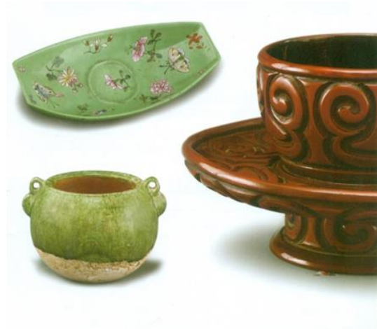
Figure 2: Tea sets from various dynasties

The tea costumes hall is a mirror of typical Chinese tea costumes. For example, Tibetans drink hot buttered tea in their tents. In contrast, the Dai people in Yunnan put tea leaves in a clay pot and roast till scent comes out of the teapot, and then they pour it in the hot water to prepare tea in their bamboo houses. However, people in Sichuan drink a bowl of tea while chatting on bamboo chairs. Conversely, Anhui tea salesmen sell tea in the front room and produce tea at the back of the house.