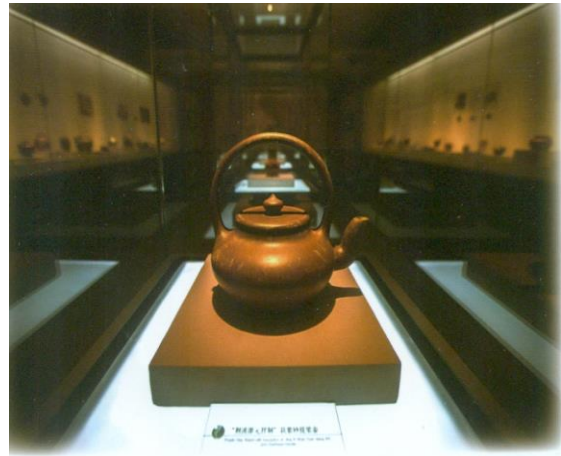
Figure 3a: Typical Tea costumes found in China