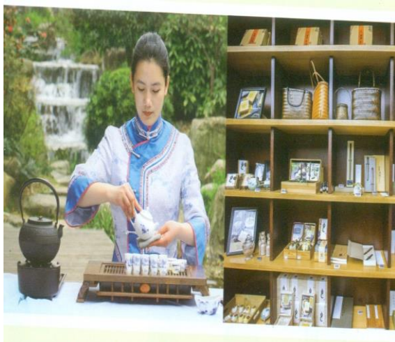
Figure 4: Tea ceremony and TV presentation

The world tea hall presents the story of how tea traveled from China to the rest of the world. There are more than 60 countries and areas that produce tea across the globe. The people who live in different countries have different ways of cultivating, making and drinking tea.