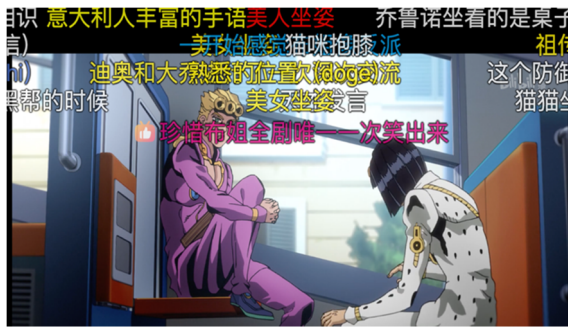
Figure 1 Screenshot from JoJo’s Bizarre Adventure: Golden Wind

the streaming content. Figure 1 is an example selected from the anime content.