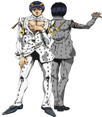
Figure 2 Bruno Bucciarati

a braid going along the top of his head and a hair clip surmounted on each side of his bangs. His attire is composed of an all-white suit covered in small black spoon-like symbols, with an open chest and zippers in random places. Underneath his jacket is a lace top, which is an indication of femininity.