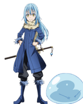
Figure 6 That Time I Got Reincarnated as a Slime | Rimuru Tempest

In another Japanese animation, That Time I Got Reincarnated as a Slime , anime fans on Bilibili nicknamed the main character "the King of Cuteness", a relatively feminine name. The anime is about a salaryman who is murdered and reincarnates in a sword and sorcery world as a slime with unique powers and gathers allies to build his own nation of monsters. The protagonist used to be a middle-aged masculine man, while his appearance morphs into a long-haired, big-eyed child that has no visible male characteristics as he gets reincarnated. He is often mistaken for a young girl due to fans' notions of femininity such as cuteness and sweetness. Therefore, this character is viewed as another powerful evidence of anime fans' gender stereotypes.