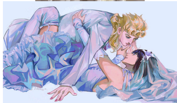
Figure 8 Fanart uploaded by users of Bilibili

The above pictures are two of the most popular artworks. The second picture depicts a romantic wedding scene that Bucciarati is holding Giorno Giovanna, the protagonist of Golden Wind, and staring into his eyes with the coyness of women. He wears the mermaid gown that exudes grace and elegance with his fitted waist and hips and gentle flare at knees. The veil that constructs swathes of intricate lace suggests his identity as a bride. There is no doubt that Bucciarati is portrayed as a female in those two images, and that triggers the speculation of what social aspects are hidden behind them. Traits traditionally cited as feminine include gracefulness, cuteness, and tenderness; due to the conventional stereotypes of femininity, fans firmly believe that Bucciarati is the “heroine” and thus render him the appearance of a female.