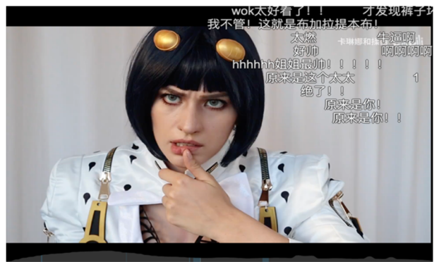
Figure 5 One of the female cosplayers on Bilibili

Arguably, a delicate issue is revealed through the fact that an increasing number of people give tacit consent to female cosplayers of Bucciarati. In the light of the fact that people unwittingly hold the belief that cosplayers of Bucciarati should be females because of the current phenomenon incurred by gender stereotypes, the male gaze is likely to take place. “The ‘male gaze’ invokes the sexual politics of the gaze and suggests a sexualized way of looking that empowers men and objectifies women. In the male gaze, a woman is visually positioned as an “object” of heterosexual male desire” [11]. Based on the given extract, gender stereotypes would have a negative externality on female cosplayers owing to male viewers’ “primordial wish for pleasurable looking” [12]. Recently, bullet comments like “it’s best to wear fewer clothes since Bucciarati exposes his chest” or “the quintessence of Bucciarati is the lace underwear, so the cosplayer should wear it” have sprung up like mushrooms after rain.