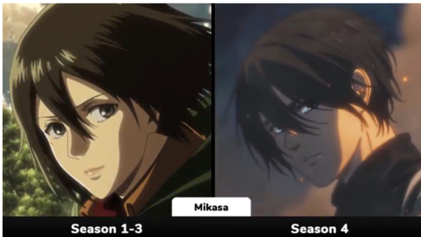
Figure 7 Comparison of physical appearances of Mikasa Ackerman in different seasons

On the other hand, notions of masculinity are held by users. Mikasa Ackerman, one of the deuteragonists of Attack on Titan, is nicknamed “the Tough Guy”. Ackerman is made to look more feminine in the anime in the training part of season 1 and the season 2 opening, but she looks more like a tomboy than ever in season 4. This is because she has grown older and cut her hair. Moreover, she is quite stoic and level-headed, rarely seen to lose her cool or be at a loss of what to do, no matter how bleak the situation seems to be. Her remarkably strong will is a masculine trait: “Evidence suggests that men who strongly endorse masculine traits display an atypical presentation of depression, including more externalizing symptoms (e.g., anger or substance use), but fewer typical, internalizing symptoms (e.g., depressed mood or crying)” [15]. Consequently, fans’ notions of masculinity lead to the creation of this nickname.