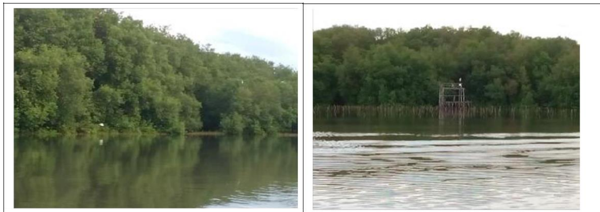
Figure 1. Mangrove ecosystem of LMC

Beside birds, some other fauna can be found such as fishes, crustaceans and amphibians. Some different invertebrates, such as molluscs and arthropods, can be easily found the LMC.