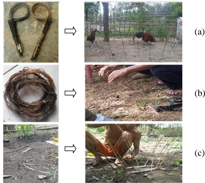
(a) (b) (c)

The chicken obtained from the hunt is a red jungle fowl. Red jungle fowl obtained from hunting are very wild, so hunters of red jungle fowl do not keep much of their catch [6]. The wild nature of red jungle fowl is also found in the offspring of the red jungle fowl, although it has been well preserved since incubation [23]. In addition to the above mentioned poaching methods, there are several other ways to catch red jungle fowl in nature, such as airsoft gun, rifles, and catapults [14,15]. The catching method is not obtained by the red jungle fowl in a state of life, so the catch is not environmentally friendly and leads to a decrease in the red jungle fowl population.