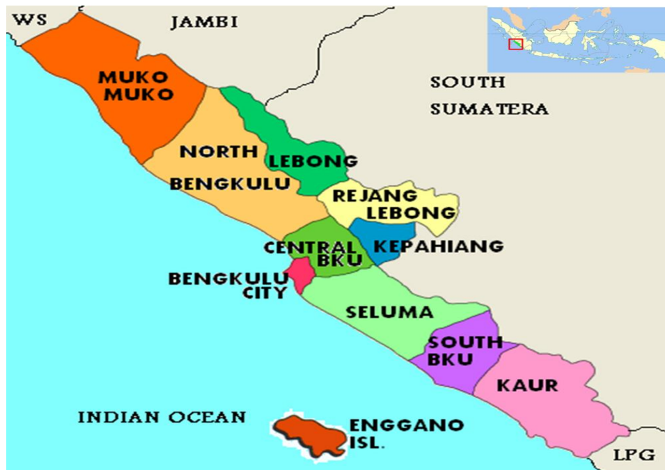
Fig. 1: shows the map of the province of Bengkulu and the location where the research was conducted

The data was obtained from the breeders selected as respondents by using a combination of in-depth interviews, questionnaires and a direct observation. The data collected was the origin of breeds (buying, hunting, or conferral), the origin of breeds purchase, hunting equipment, and the purity of breeds. The data obtained are presented in the form of tables and drawings and analyzed descriptively.