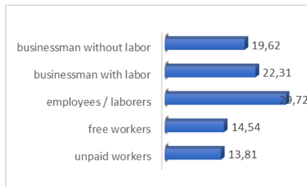
Figure 2. Percentage of Workers by Primary Employment Status in Tulungagung Regency 2019

Based on the results of interviews conducted online business conditions from 5 different respondents. This is because in the time of covid pandemic the type of goods needed by the community more leads to the