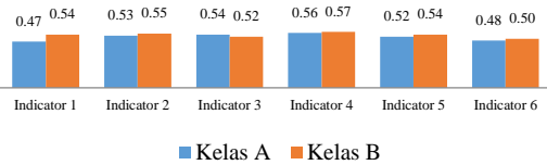
Figure 1: Bar Chart Classification Indicator Early Learning Motivation Class A and Class B

The results of the pretest test of student motivation showed that the average value for class A was 51.25 and the average value for class B was 53.53. This shows that the initial motivation of class A is lower than class B even though both classes are in the category of moderate learning motivation. The following is a bar chart for each indicator of student motivation for class A and class B.