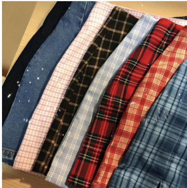
Figure 1 Chequer Pattern

these goods is particularly devastating to the original brands in the Chinese market [11]. For instance, when the Italian luxury brand Valentino Garavani decided to march into the Chinese market, more than 200 counterfeit brands were discovered, which completely blocked Valentino's profit, making it losing possible revenues that it would have gained in China [9]. Similarly, for Brandy Melville, on Alibaba - the Chinese biggest online retailing platform - a lot of similar items appeared (see figure 2). When people can conveniently get a similar product at a lower price, there is no reason to wait for six months for a replenishment. The emergence of a significant number of counterfeit products led Brandy Melville to lose a considerable amount of demand.