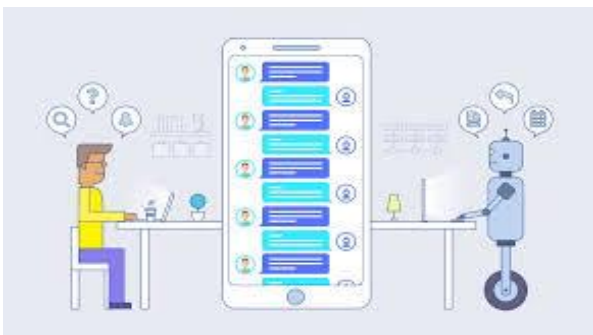
Fig. 6. Web artificial intelligence-based chatbot application.