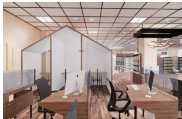
Figure 1 Interior design of private reading area and multimedia area public library of Banten Province (Hanifia Tis Adevi, 2020)

At the end of the classical era, there was a surfeit with the forms, concepts and norms of classical architecture, which had ruled the world of architecture for thousands of years, for example the Renaissance when Romanian elements and Grecian elements were still fancied. From historical point of view, the repetition of forms or it can be said that there were not too many choices and mixtures, and were still bound to classical principles, in architectural developments often referred as the Neo-Classical or Post-Renaissance era [14].