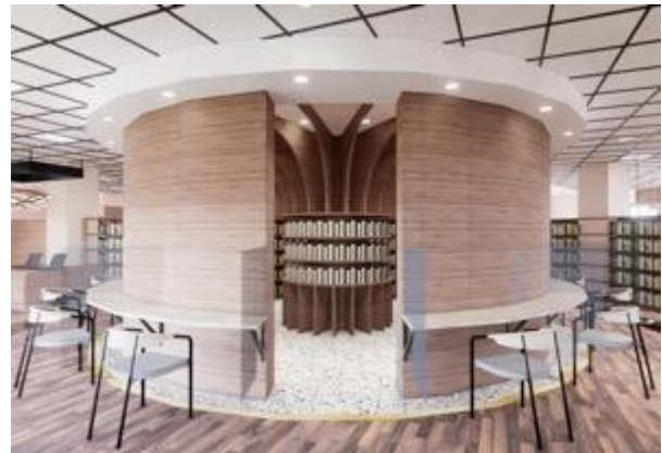
Figure 3 Interior design of round reading area and public library of Banten Province (Hanifia Tis Adevi, 2020)

The design of this library, WPC (Wood-Plastic Composite) as the basic material for the bookshelf for finishing, uses wood-motif HPL (High Pressure Laminate) with dark brown color and white HPL to balance it. Indeed, the coloring is dominantly brown (both light and dark), beige. White, with gold accents on certain areas.