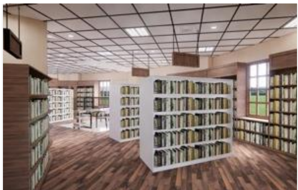
Figure 7 Interior design of book shelves in reading area and collection room public library of Banten Province (Hanifia Tis Adevi, 2020)

The application of the classic style is barely perceptible on this design because there are not many principles or characters from the classic style in this space, and the use of borders and molding from the classic style itself has simplified the shape, the dominance atmosphere of the contemporary design is more perceptible.