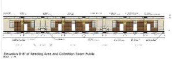
Figure 6 Elevation B-B' of reading area and collection room public library of Banten Province (Hanifia Tis Adevi, 2020)

The application of the classic style is barely perceptible on this design because there are not many principles or characters from the classic style in this space, and the use of borders and molding from the classic style itself has simplified the shape, the dominance atmosphere of the contemporary design is more perceptible.