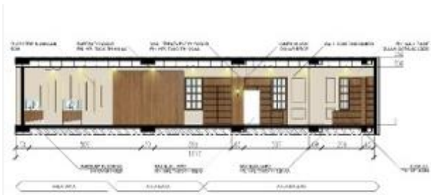
Figure 5 Elevation A-A' of reading area and collection room public library of Banten Province (Hanifia Tis Adevi, 2020)

The use of cool daylight lighting does not give a warm impression to the atmosphere, which indeed prioritizes the needs of users (librarians) to feel comfortable when reading in the room. There is a classic style armature lamp on part of wall treatment which can be seen in the figure 5 below.