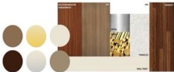
Figure 2 Mateial and color schemes on reading area and public library of Banten Province (Hanifia Tis Adevi, 2020)

The house-shaped partition does not represent a certain style, both classic and contemporary facilities, only as a private reading area, which between the librarians has their own space with a triangular roof so that it is not too simple. The application of eclectic style for the library is a transition style that has “gender neutral” as an identity, combination masculine and feminine element from room design to create comfortable and relaxing style [8]. Visually, the eclectic style looks simple, minimalist and elegant [8]. The minimum amount of using room decoration and accessories as the basis identity of contemporary style, combined with elegance from classic style, is one of the identity of this style in order to focus on simplicity and technology in design [8].