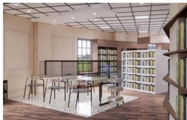
Figure 4 Interior design of reading area and bookshelves in collection room public library of Banten Province (Hanifia Tis Adevi, 2020)

The use of wood for finishing is usually warm colored but can be colorful based on the natural surface to the varnish which has a high cluster level. The choice of fabric for coating can be varied based on the material that is obsolete resistant to soft luxurious fabric. The balances mixture on several textures is commonly used in this style.