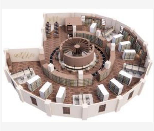
Figure 10 Axonometri of interior design of reading area and collection room public library of Banten Province (Hanifia Tis Adevi, 2020)

From the analysis result of comparison between literature study and new interior design for reading and collection room, it can be seen that the dominance of the principles and characters of eclectic style has been applied, but not very visible because there is still lack of the application of principles and characters of these styles. Overall, the interior design of the library apply simple contemporary style yet still gives warm atmosphere as can be seen on most part of finishing by using wood, less decoration in monochrome colors, as well as classic simple look but contemporary as applied on molding wall treatment and border setting-up on the top of book shelves. By using metal as one of material, radiating an even feminine and masculine elegance image.