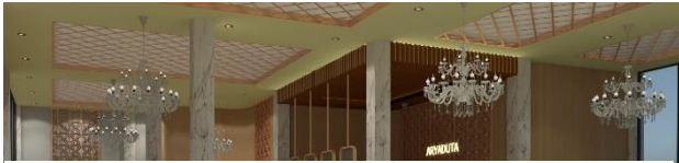
Figure 9 Examples of applying ceiling forming elements to the lobby area (Elvi Livia, 2020)

On the ceiling in the lobby area, you can see a dominating yellow paint finish with accents with the use of laser metal cutting and wood on the reception ceiling area. The simple appearance but with the addition of this accent makes the ceiling more attractive.