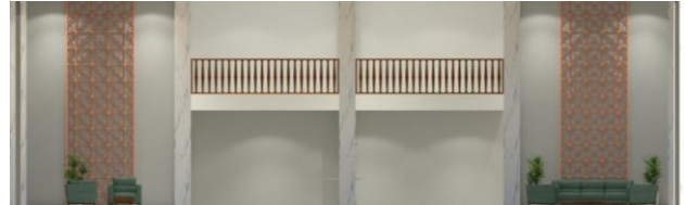
Figure 7 View of wall b in the lobby area (Elvi Livia, 2020)