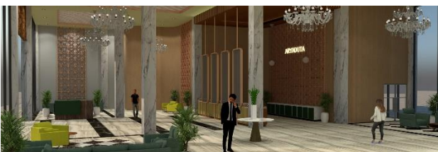
Figure 5 Examples of application of space-forming elements in the lobby wall area (Elvi Livia, 2020)