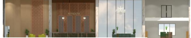
Figure 6 View of wall a in the lobby area (Elvi Livia, 2020)