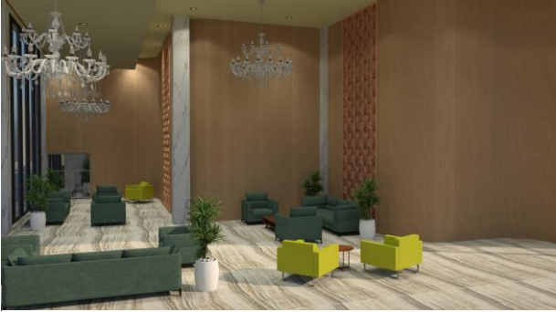
Figure 4 Examples of applying floor space forming elements to the lobby in the lounge area (Elvi Livia, 2020)

As seen in the picture above, the floor elements give an elegant impression to the room by applying the materials used.