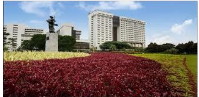
Figure 1 The façade of the hotel building aryaduta Jakarta (google.com)

Hotel Aryaduta Jakarta is located in a strategic location in the center of Jakarta, namely: Jl. Soldier KKO Usman Dan Harun, Gambir District, Central Jakarta, Special Capital Region of Jakarta 10110.