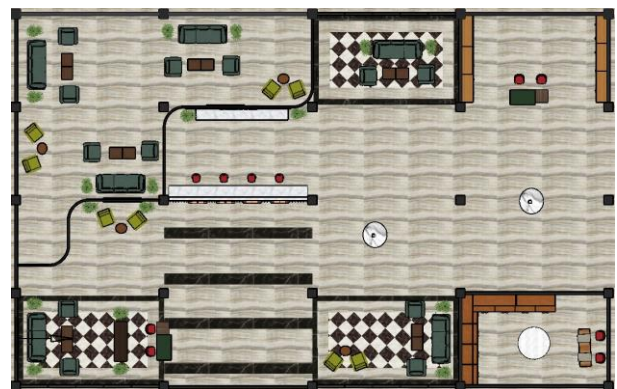
Figure 2 Floor plan aryaduta hotel lobby Jakarta (Elvi Livia, 2020)