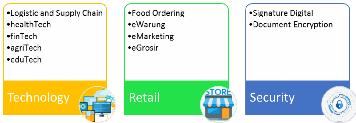
Figure 3 Digital sector

Based on the explanation of the innovation provided, it can be illustrated by the business opportunity for a pandemic to support the Less Contact Economy, you can see Figure 3.