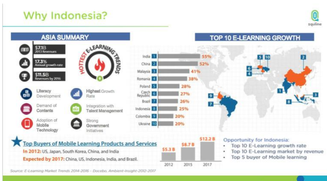
Figure 2 e-Learning market [2].

It can also see this increasing need for information from the declining hospital visit data but an increase in the use of teleconsultation services by the community during this pandemic. The public, doctors, and hospitals are now also starting to look for digital platforms to serve patients despite various limitations still.