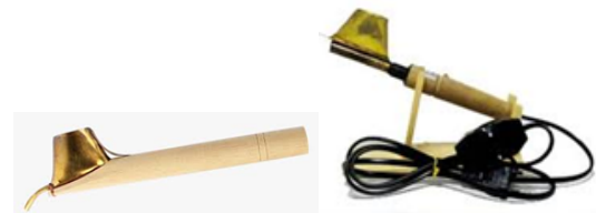
Figure 3 Canting