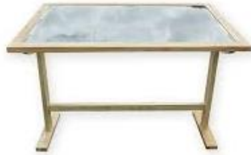
Figure 2 Drawing table

supports, and frames equipped with lamps, and the table surface is mounted with a certain slope to comfort the body and eyes in drawing work.