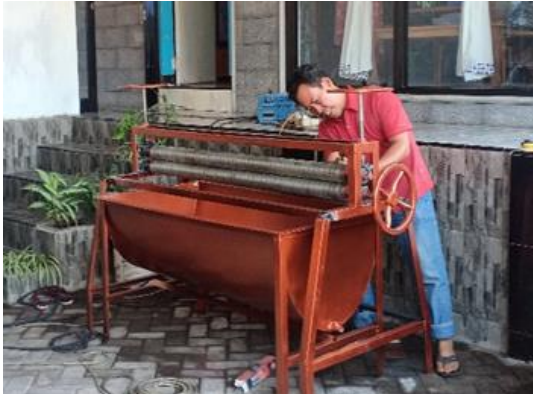
Figure 5 Padder

d. Padder is a tool for the process of color strengthening (color fixation) on batik cloth. The padder consists of a tub and a roller. In this coloring process, chemical additives other than dyes are used. This tool makes it easier for the dye to absorb more quickly and evenly into the fabric fibers so that the color results of batik are better and the process is faster. In general, another alternative with economic considerations, this color strengthening process is carried out by immersing it in the bath only, without the roller which functions to suppress and strengthen the absorption of the dye liquid in the fabric fibers.