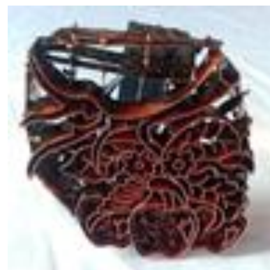
Figure 4 Canting cap