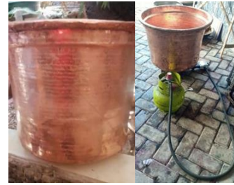
Figure 6 Kenceng

e. Kenceng is a tool to shed wax on batik cloth using hot water. Kenceng is shaped like a barrel which is generally large and made of copper metal. Heating is usually equipped with a stove. This copper plate is a good conductor, can provide fast heat, and can withstand heat for a long time, making it more energy-efficient. Also, it can give the impact of batik coloring that is better in color than with other heating materials. An alternative tool from kenceng with economic considerations, in general, a large regular cormorant is used.