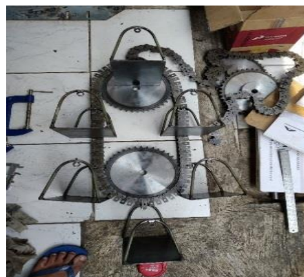
Figure 3 Mechanical component layout assembly process

The design of the mechanical system includes the design of the prototype of a vertical car parking system, including iron construction, determining the layout of the mechanical components in order to be sustainable with each other. The mechanical system design also determines the exit and entry positions of the car as a means of system simulation. In addition, the location of the control panel which functions as the central processing of control signals is illustrated. Figure 3 shown mechanical component layout assembly process.