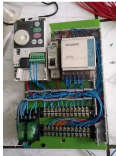
Figure 2 The process of installing power and power cables

The design of the mechanical system includes the design of the prototype of a vertical car parking system, including iron construction, determining the layout of the mechanical components in order to be sustainable with each other. The mechanical system design also determines the exit and entry positions of the car as a means of system simulation. In addition, the location of the control panel which functions as the central processing of control signals is illustrated. Figure 3 shown mechanical component layout assembly process.