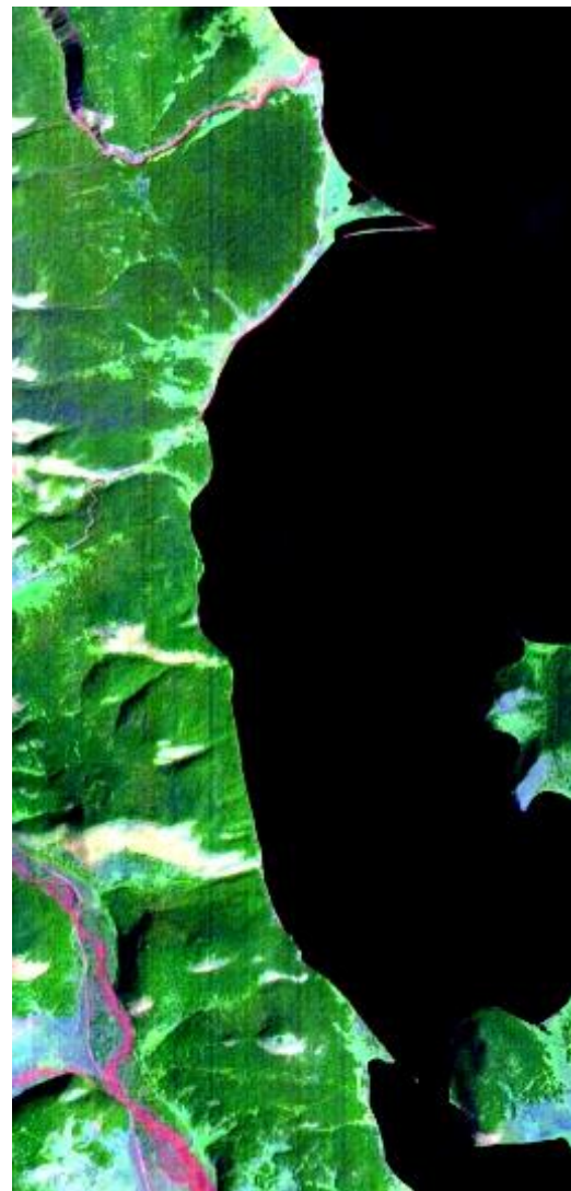
Figure 1. Hyperion image of the test area

As a test site, a coniferous forest-dominated area situated in western part of the Lake Khuvsgul, northern Mongolia has been selected. The lake is considered as the second largest fresh water lake in Asia after the Lake Baikal with 100 km in length, 35 km in width, and over 265 m in depth. The lake lies at 1645m above sea level where mountains on the western shore rise up to 2961m and the mountains on the northern shore even up to 3491m. The annual precipitation in the region is about 350-400 mm and it makes the area as the most humid region in the country. The area selected in the west of the Lake Khuvsgul represents a forest ecosystem and is characterized by such main classes as coniferous forest, grassland, soil, bare land, dry river bed and water.