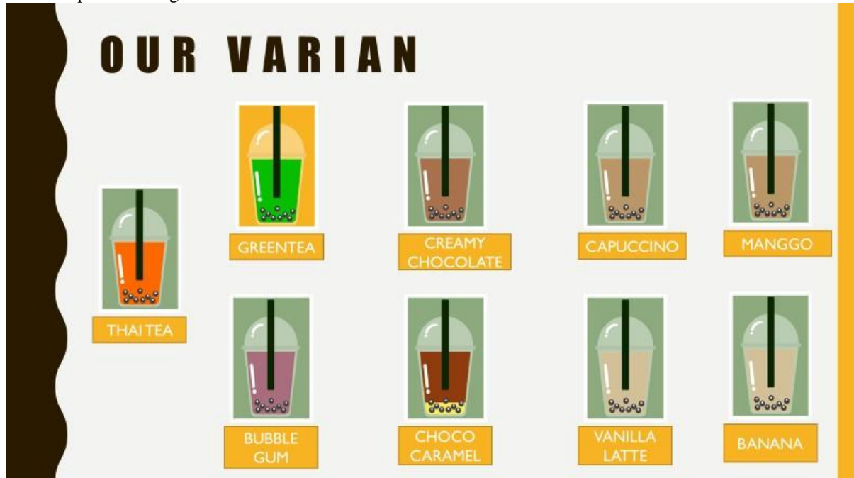
FIGURE 2. Product

beverage, with special design and innovation which different from others.