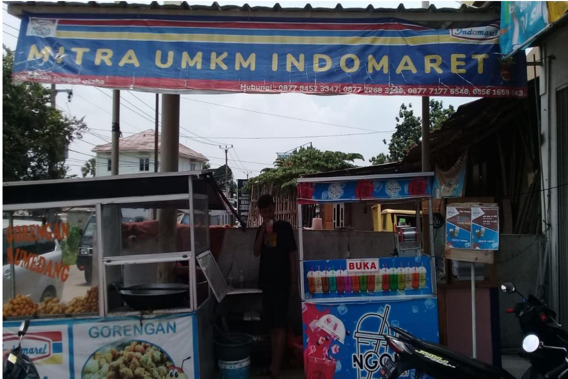
FIGURE 4. The location of Ngombe is in Indomaret area