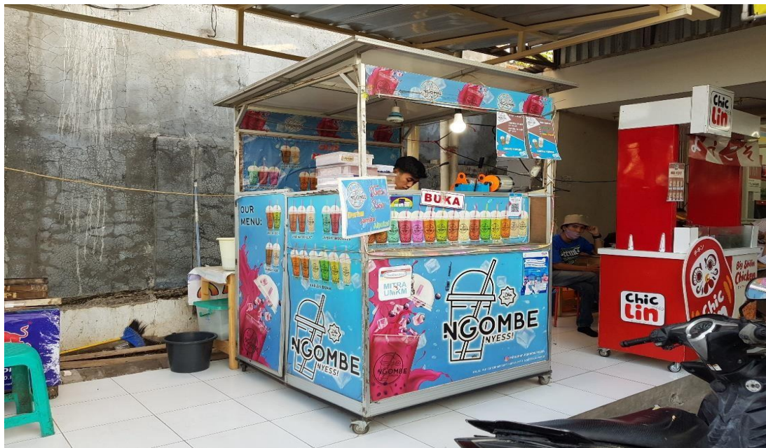
FIGURE 3. The location of Ngombe is in Indomaret area

The location of Ngombe is in Indomaret area because there are many customers who shops there.