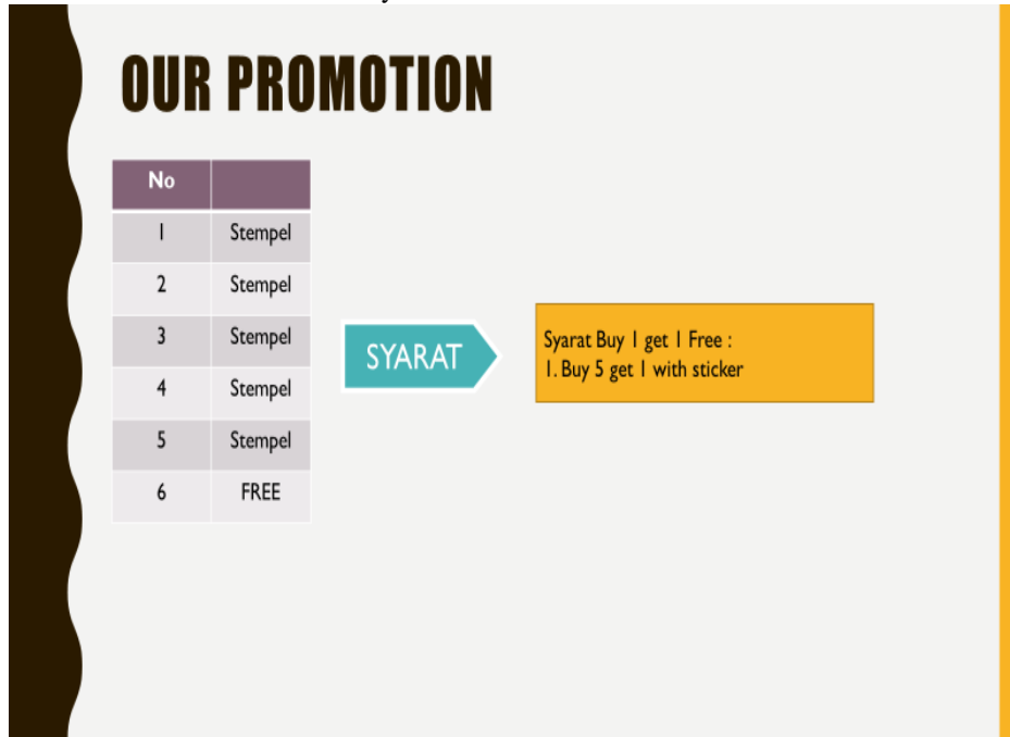
FIGURE 6. Layout Our Promotion

around the location but customers from wider area can also know about NGOMBE beverage through GO FOOD and GRAB FOOD.