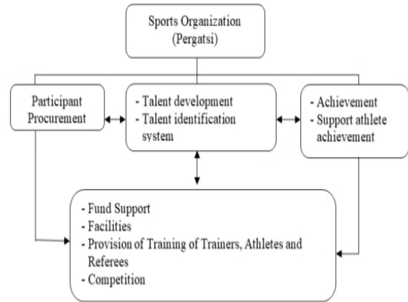
Figure 1: Sports Coaching Scheme

The sports coaching scheme is as follows: