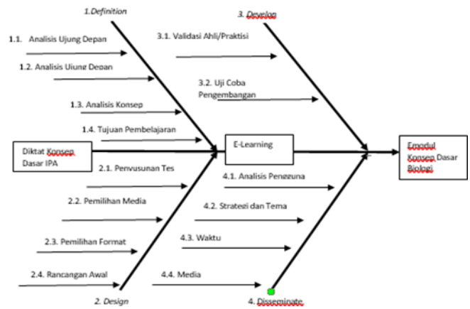
Figure 2 Fisbone research development e module biology basic concept course PGSD FIP Unimed

Data analysis in this study will be divided into 2 types, namely (1) Data analysis of the validity of the Basic Biology Concepts Module E, (2) Analysis of test results to students. The process flow for carrying out research on the development of E Module Basic Biology Concepts can be seen in the fishbone image below: