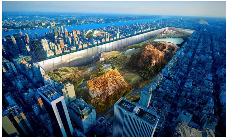
Figure 2 The project "New York Horizon" (USA) 2016.

The project has designed to contrast with the densely constructed buildings and tall skyscrapers of the city. This will create a new urban organization where the newly built landscape will become a unifying part of the city [14]. Glass facades of skyscrapers will reflect the natural landscape of the park and create the illusion of an infinite natural world ("Figure 2"). The aim of the concept is to bring back the traditional relationship between landscape and architecture . Instead of building long, flat landscapes surrounding and complementing individual architectural buildings, the natural landscape in this sentence is the central element.