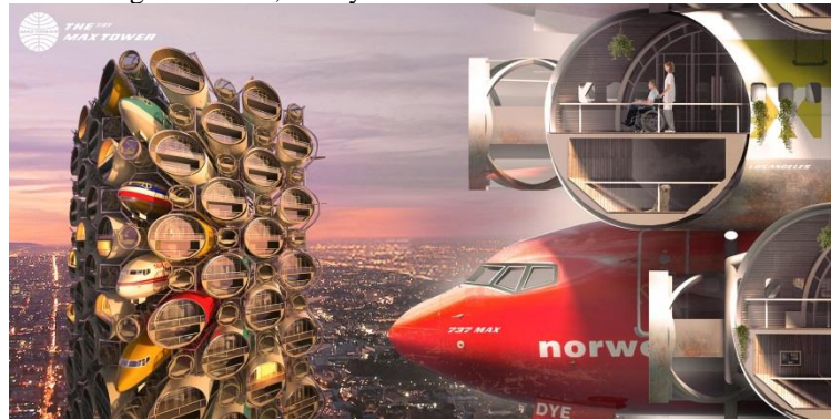
Figure 6 The project «The Boeing 737 Max Tower» (USA) 2020.

Lu Xu) is to use the plane's spatial potential and giving them a second life as part of a skyscraper. This allows not only provide comfortable and pleased living conditions for veterans, but also their physical and mental well-being, as well as social needs ("Figure 6"). The authors believe that this project is not just a cult tower, but also a reproducible construction system that can be used in many different contexts [28].