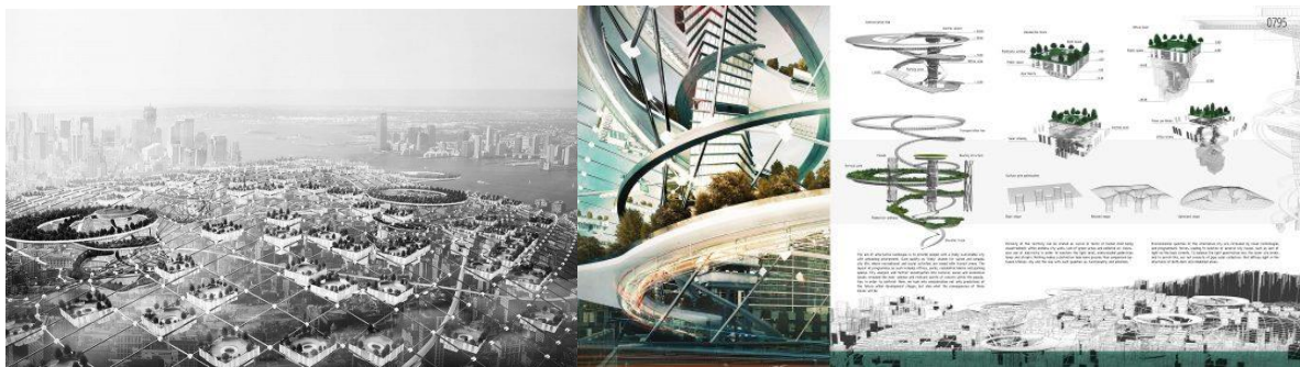
Figure 3 The project «New City Grid Floating Above Existing Cities» (Belarus) 2016.

The aim of the alternative landscape is to provide people with a sustainable city with diverse and complex environments, where recreational and social activities have mixed with transit zones (“Figure 3”). The environmental qualities of the alternative city has enhanced by new technologies and software elements, which leads to the solution of several urban problems. Communication between zones and local buildings carried out on hanging transport routes [18].