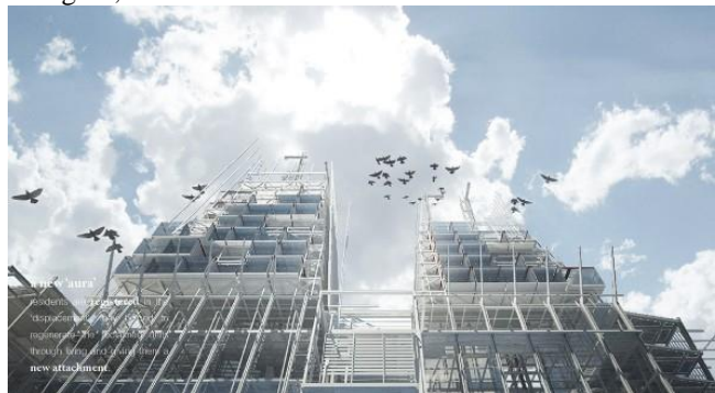
Figure 4 The project «The Displacement or the Revolt of Abandoned Architecture» (Hong Kong) 2016.

in Japan has created artificial islands in the Gulf of Tokyo as a way to bury the evidence of earthquakes, as well as indirectly reduce landfills. This is where, with the help of boats and ships, such facilities moved and then recycled in local factories, providing builders with new design systems (“Figure 4”). The spatial structure located on the island will constantly filled with new objects in stages, and eventually it will reach saturation [20].