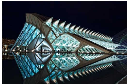
Figure 4 City of Arts and Sciences in Valencia. 4

It is elusive and flowing. Sense of future is embodied by highly lucid and pure artificial creation, with the feeling of primitive simple substance. It surpasses all the familiar spaces of modern times, but it is not completely as same as the sense of strangeness. It gives people a beautiful yearning. Calatrava's architecture looks very futuristic. The geometric form of the perspective state reflects a sense of time, and the geometric level looks like a time cave, with a post-modern sense of space. The Barcelona Concentration Tower with ring arms, City of Arts and Sciences("Figure 4") in Valencia, the Bilbao Airport with a peculiar skeleton, and the Lyon Airport design like the head of a Transformer may remind people of the scenes in science fiction movies or animations. His design creates cyberspaces such as Ghost in the Shell and Blade Runner . Futuristic architecture produces fantastic feelings in the living environment, and it also interacts with movies, constantly refreshing people's perception and imagination. The blueprint of human's living environment has quietly changed in the process of form innovation.