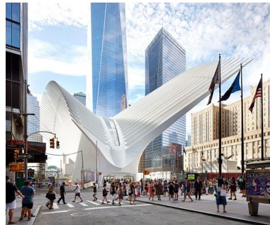
Figure 5 New World Trade Center. 5

However, some unsatisfactory design should be focused. Due to mismanagement and lack of funds, the Athens Olympic Stadium in Greece was nearly abandoned. The publicity of the Olympic venues is based on the national public construction. After such a sports event held, the use demand falls to a low point. If there is a lack of organized planning and utilization, the functional value of the building will gradually disappear, and not to mention that the government cannot keep the normal maintenance of this giant. The multiple identities of the new World Trade Center("Figure 5") ensure that it will not suffer like this. First of all, it is a memorial site with cultural significance for disaster. Secondly, it is a functional transportation hub. The huge wing steel structure makes it distinctive in the space. The continuity of time and space is an important principle in the language of modern architecture. "People live in this space and they are affected by it, and in turn, they also affect the space." (Savi, 1986, p51)[7] Design and planning can make space meaningful.