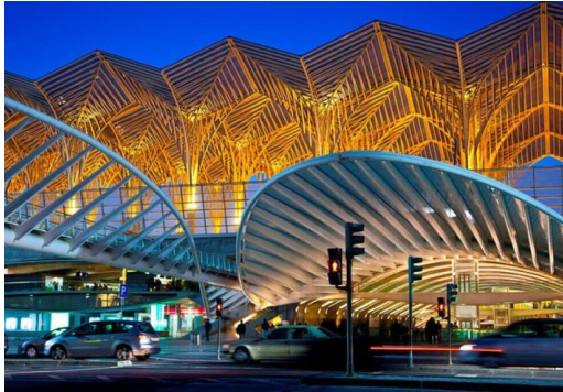
Figure 2 Orient Station of Calatrava. 2

symbol is not a simple imitation, but an external awakening and practice of spiritual resonance in human spirit.