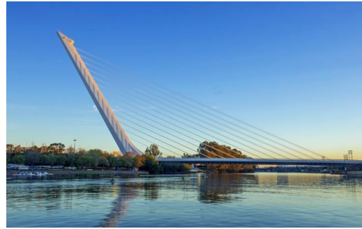
Figure 1 Alamiro Bridge. 1

Calatrava is good at applying force's movement trends to architecture. "But the real force is not necessarily beautiful. What is beautiful is only the visual sense of force. This is the essence of force performance." (Wang, 2004)[8]. Therefore, with amazing engineering mechanics talent, Calatrava had completed a series of visual "impossibility". The inclination of the Alamiro Bridge("Figure 1") in Seville reaches 58 degrees, and the 142-meter-high tower is used to balance the bridge deck. The shape of the bridge resembles a noble and elegant fairy harp, with a tendency to collapse instantly. The structure is static and stable, but there is a tendency to fly or fall, which brings a strong sense of tension visually. Sonnis calls this aesthetic state "the gestation moment", which means that change is about to happen. This statement is similar to the concept of "inclusive moment" proposed in Lessing's "Laocoon", which mostly expresses the temporal momentary scenes appeared in painting and sculpture art, allowing people to feel the moment before and after.