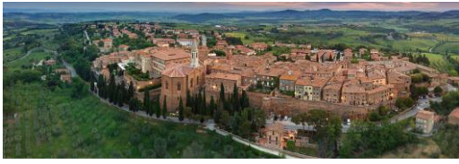
Figure 2 Pienza (former Corsignano), Italy.

The two different deeds of incorporation were the change of the village name with the onomastic one of Pienza (an option, we can say of hellenistic taste) and the institution on 13 August 1462 fo the diocese (the prot-obishop Giovanni Cinughi took office on 1 September). The urban plan is that of a rectangular figure with rounded corners, with axial decumanus, today Rossellino street, and a barycentre as a forum (today Pio II place) with the cathedral, Piccolomini palace, formerly cardinal palaces and the one of the canons. The only urban significant survival, on the West side of the dynastic headquarters is the Medieval convent of Saint Francis; and the extra-urban parish church of Saint Vito, connected actually to the baptism of future pope Pius II. The sacred value is evident in the overhang positioning of the cathedral apse, with all the references to the City of God on the Mountain, but also of Oreb/Tabor/Golgotha and of pinnacle of the Temple.