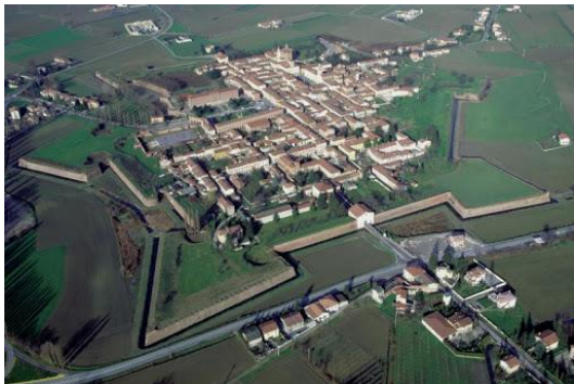
Figure 8 Sabbioneta, Italy.

The objective datum is however the welding, only for the 16th century, between the geometric rigor of the system and the urban ideality rate, also found in urban planning of the new capital towns (emblematic the case of Torino from 1563, but let's think also to the uninterrupted urban planning effort of Rome during the whole 16th century) which can't be considered - I repeat - ideal cities, but continuations of the open topic with Ferrara. The same goes for military citadels, with urban plan functional to the defensive structure and often refined updates with respect to the evolution of military technology: but the result is a strict geometric structure, not an ideal city for the same functional definition underlying. And this can be applied for Terra del Sole (dal 1564) as well as for many other Italian and European cases. It is certainly an ideal city Sabbioneta [41], projected since 1554 and built from 1556 for the will of his duke, Vespasiano Gonzaga Colonna (1531-1591), at whose death the project was substantially concluded ("Figure 8").