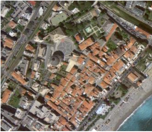
Figure 10 Loano, Italy.

Here the patronage of Giovanni Andrea Doria with Zenobia Del Carretto and of Andrea II Doria with Giovanna Colonna created an ideal space, since 1575 and until the early decades of the 17th century: a walled city (moreover with singular alternations, from powerful bastions to refined loggias) with a pentagonal plant, with orthogonal road system, three regular places, a dense presence of religious buildings - the cathedral, the ancient parish church, the Bianchi oratory inside the walls; the Loreto sanctuary and the three great Augustinian, Carmelite and Capuchin convents outside the walls - definitely excessive for public needs, but not for the symbolic ones. If in particular the complex of Sant'Agostino is linked to the first couple, the one of Monte Carmelo is the funeral space of the second couple, with all the visual instances of the now ancient dialectic seen in Castiglione Olona and the civitas hominum at the foot of the civitas Dei super montem posita and moreover emphasized by the large connecting viaducts. In Loano the reading of historical precedents is particular. The identification of the ancient village with the Roman Pollupice is entirely hypothetical, despite the mosaic findings, and the orthogonal scheme is totally ex novo ; but it is also the return in 1309 to the Marina, for Raffaele Doria's will pact, of the medieval village super podium , that is near the future Carmelite convent.