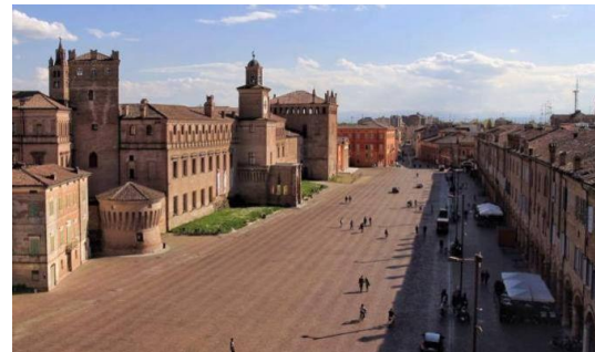
Figure 5 Carpi, Italy.

There is much to reflect on this urban mirroring of the humanistic lordship, on this cultural justification of the principedom, which is thing long gone from the sacralized ideal city. To some extent, this can be true for all courts, from the great capital city to little centers; and they all contain some idealizing element or some more ambitious intervention. Thus, Gerolamo Riario's domain non