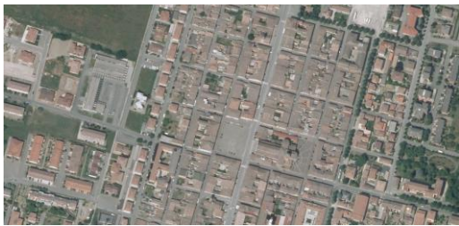
Figure 4 Cortemaggiore, Italy.

One step is still missing: that from fief to principedom, how at least the second term takes shape in the debate and in the political praxis of the second half of the 15th century. Considering these themes the earlier cases are Cortemaggiore [32] ("Figure 4") and Carpi.