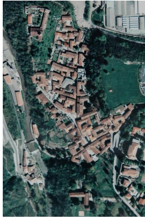
Figure 1 Castiglione Olona, Italy.

These are the premises (a little bit different compared to the historiographical vulgate) for the humanist reworking of the theme of the ideal city, whose impact can be clearly seen in the first astonishing case in Italy: Castiglione Olona ("Figure 1") [20].