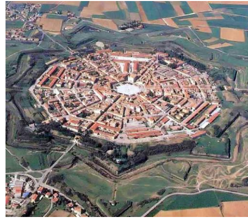
Figure 11 Palmanova, Italy.

At the end of the 16th century a point of synthesis and evolution is represented by the city fortress of Palmanova ("Figure 11") [44], founded in 1593 by the Venetian Republic (note: the only case of a republican state and not governed by an ecclesiastic or a prince) with an anti-Turkish and de facto anti-Hapsburg function, with the project of Giulio Savorgnan.