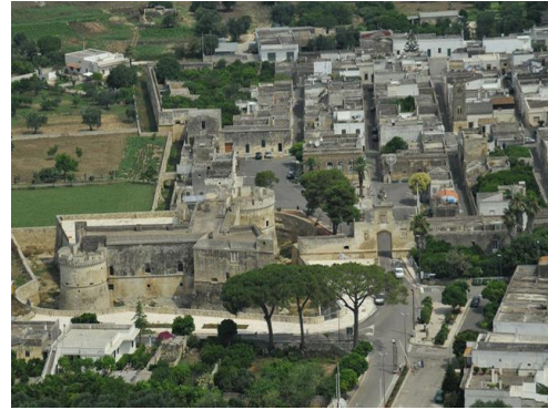
Figure 7 Acaya, Italy.

foundations, especially conventuals, in dialectic with a strong agricultural activity and of wool production; and an original urban plan with parallel streets with the use of terraces. A particular speech deserves Acaya [40], [39], hamlet of Vernole in Salento ("Figure 7").