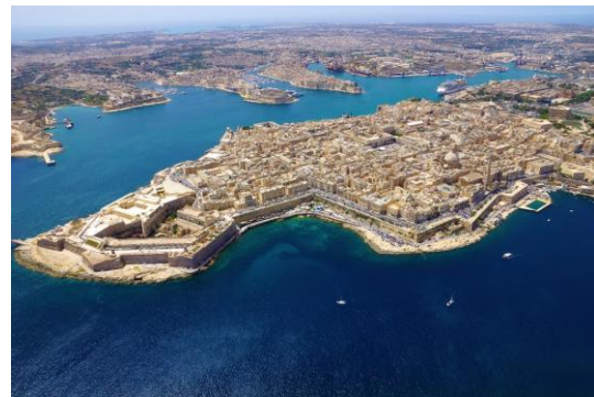
Figure 9 La Valletta, Malta.

The point of suture between military city and ideal city is established by the foundation of La Valletta ("Figure 9") in Xagh-ret Meuiuia on the Malta Island [42].