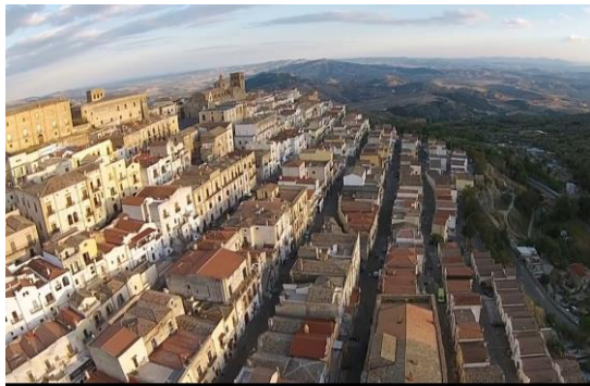
Figure 6 Ferrandina, Italy.

The Italian crisis from 1494 certainly caused a prolonged stasis, so that in the first half of the sixteenth century there are few useful cases in general new feudal foundations within the limits described above. A borderline case because it is a direct emanation of the ruling house is Ferrandina [38], [39], the ancient Uggiano Lucana ("Figure 6").