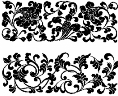
Figure 1 Honeysuckle pattern