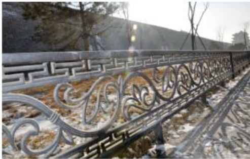
Figure 2 The city guardrail in Datong

As shown in Figure 2, Datong City, Shanxi Province applies the traditional honeysuckle pattern to the pavement fence, highlighting the traditional culture of the ancient capital of history. The dynamic stretch of the pattern echoes the light and shadow on the ground under the sunlight and makes the whole street more dynamic and dynamic. It creates a half-intersecting echo space between the two straight roads. The extended honeysuckle pattern creates a cultural bridge between traditional culture and modern commercial space. At the same time, the traditional carrier of traditional honeysuckle pattern grain applied to urban guardrails is also its own new development.