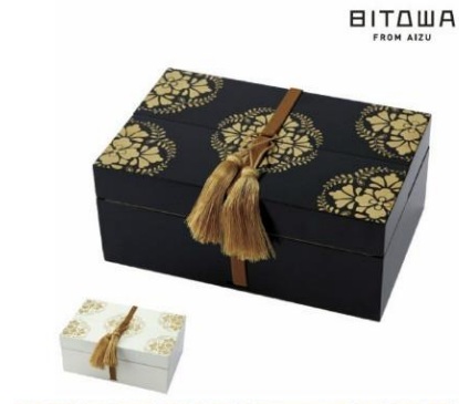
Figure 4 Tea box