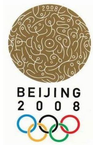
Figure 5 Beijing Olympic Games logo design

What the logo design needs most is a refined and generalized design language. The allegorical expression of the element is particularly important when selecting the available elements. The characteristic toughness and tenacity of the honeysuckle pattern are in line with the Olympic Games 'concept of advocating athletes' tenacious struggle and guiding human health upward. The original design of the logo for the 2008 Beijing Olympic Games will be used in the honeysuckle pattern. The lines are simplified and summarized to make their shapes and charm more integrated. As shown in Figure 5, although the shape of the honeysuckle pattern in the logo is not as complicated as the vines and branches of the traditional honeysuckle pattern, it can still be seen from the curly form of the honeysuckle pattern that conveys the sense of vitality to people, The perfect combination of culture and modern design concepts[6].