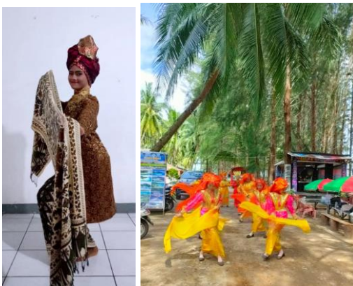
Figure 3 Anta Movement

3) Anta, this movement is the opening movement of the Salendang dance, which is performed at the beginning of the dance when the groom has arrived at the bride's house to carry out the marriage contract. The anta movement serves to take the groom to the aisle, but in the dance performance when the groom arrives at the yard of the bride's house, dampiang is immediately sung. There are 8 dancers in total