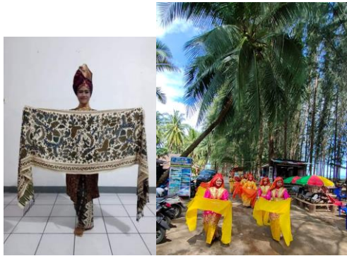
Figure 2 Paga movement

2). Paga. This movement can be interpreted as “ Kuek nan dari paga basi, kokoh nan dari paga tembok ” meaning that the strongest fence is the fence of something with good character. This movement is done in place, sometimes forward and sometimes backward.