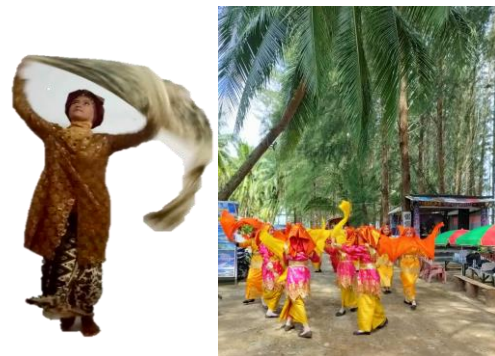
Figure 5 Limpapeh movement

5) Limpapeh, this motion imitates a flying butterfly. This can be interpreted based on the Minangkabau petitih adage : Limpapeh rumah nan gadang, umbun puruak holding the key . Women in Minangkabau are solid pillars on the household and country, and the key to the good and bad of a country. This movement aimed at women is interpreted as advice for the bride. Limpapeh which is a small fragile white butterfly. The wings are very easily damaged even if exposed to the wind the wings can be torn. Therefore, it is westernized to women who must be good at taking care of themselves. The subtlety of language outwardly should be accompanied by a gentle mind, because women are housewives who will educate children as descendants of kings and princesses. Women also have to be trustworthy because they are the holders of inheritance in the rumah gadang .