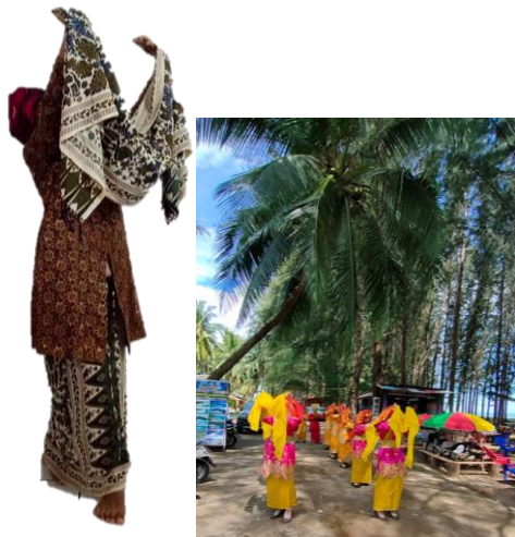
Figure 7 Kuriek Kundi movement

7). Kuriek Kundi: Nan kuriek iyolah kundi, nan merah iyolah sago, nan baiek iyolah budi, nan endah iyolah baso. The most valuable meaning in social life is to associate with good character and manners