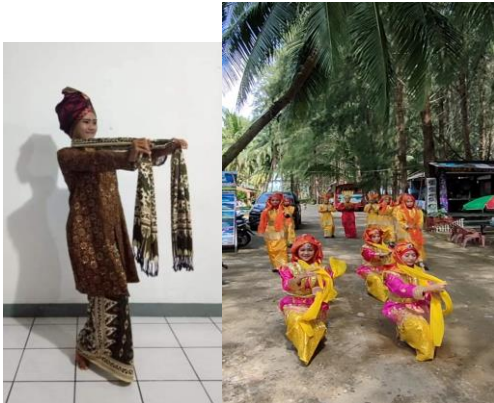
Figure 6 Ikek movement

needs of the husband can be met by the wife. It is expressed in the proverb: "Padi diikek jo daunnyo, batang ditungkek jo dahannyo". The wisdom that is used by someone in leading a nephew's son, to finance it, is looking for an effort.