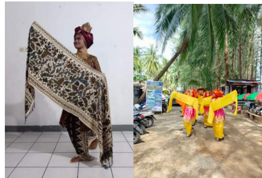
Figure 4 Balabeh movement

human morals. Therefore, in this motion, the scarf is always firmly stretched. This movement is done while walking, in a diagonal direction to the right and to the left. Every step that is taken always uses a double step or step to give birth. So that the movement is effective up and down.