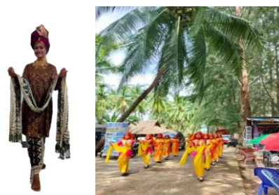
Figure 1 Warih movemnet

(1)Warih, this movement starts the Galombang Dance, all the dancers put a scarf in both hands and slowly walk towards the guests/tourists. This movement is likened to the saying " Warih samo dijawabek, pusako samo is helped ". This means that inheritance becomes a moral responsibility for the lineage that receives it to pass on to the next generation. Heirlooms must be equally helped to maintain it. The legacy will continue to be passed down to the next generation.