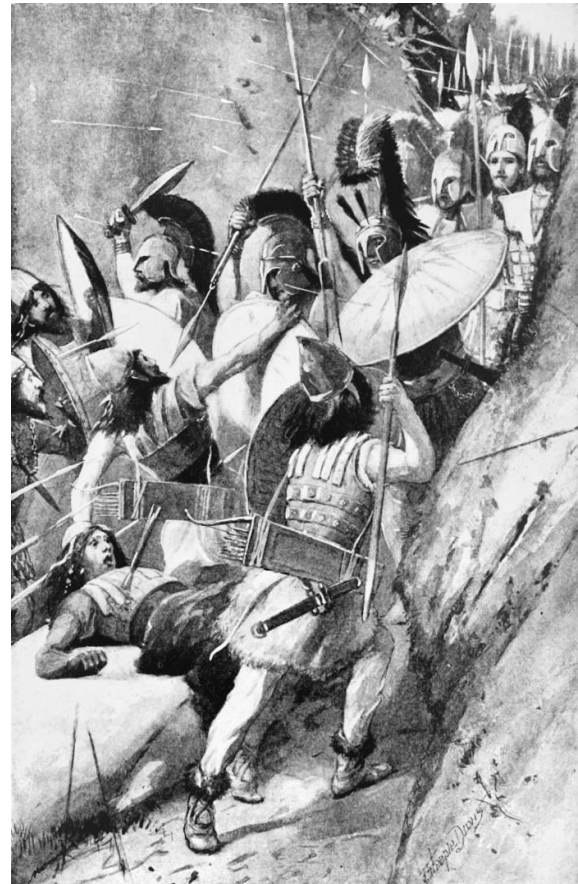
Figure 4 Battle of Thermopylae

descendant of Achilles, and shares blood with the gods. He was also the King of Macedon and the leader of the Corinth League. But why did he only mention the least noteworthy identity? What he says seems to show how he wanted the Greeks to see him. He was an honorable leader instead of a defiant monarch. These words of modesty would have a greater chance of forming a friendly and cooperative atmosphere in his army that would have long-term benefits in morale. Notably, as Philip was a prestigious leader himself, this claim could also be seen as a reemphasis towards Alexander's legitimacy in leadership, showing that leadership and wit were in his bones.