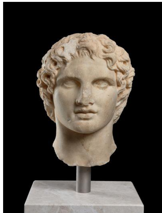
Figure 1 Head of a statue of Alexander the Great

Alexander the Great. The name of the incredible leader who conquered the most land gradually becomes this tangible historical figure through the narratives of ancient historians combined. Though many stories of this great king remain fragmentary, the anecdote of Alexander inscribing a message on the 300 Persian Armor after the Battle of Granicus appears to be one of the few best-documented stories among ancient sources.