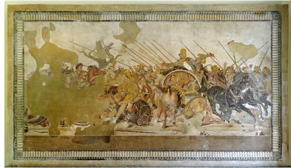
Figure 2 Alexander Mosaic from the House of the Faun, Pompeii

dedicate the armor to the Athenians instead of other city-states?