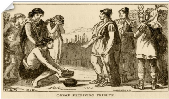
Figure 4. Julius Caesar Receiving Tribute. Marcus Ward & Co, London & Belfast [4].