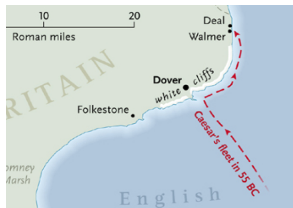
Figure 1. Caesar's Fleet Across the Channel during His First Invasion in 55 BC [1].

On August 26, 55 BC, Julius Caesar first stepped foot on the island of Britain. Caesar fought in Britain for ten weeks before ending his expedition and retreating to Gaul for winter with two Roman legions at his side, as shown in Figure 1 and Figure 2.