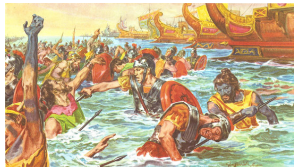
Figure 2. Darling, D. Caesar in Britain [2].