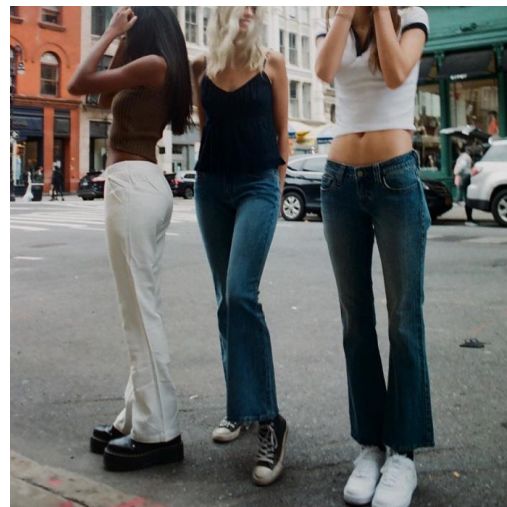
Figure 3. Models on Brandy Melville Instagram

Are these clothes really like the slogan that says "one size fits all"? One size does not fit all sizes. For example, the Brandy Melville mentioned earlier, the product of this brand has only one size, the size 0, saying that it could fit a girl who is a size 6 (Lucy Nemerov, December 6, 2017) [3]. This is wrong since not all women's bodies are equally shaped. In addition, you can see the poster below from Brandy Melville official social media that most of Brandy's models are between 5 feet 7 inches –5 feet 9 inches, with size 23–25 waist. Nearly all the models on the BM website are at least 5'7'', with waists no larger than 25''.