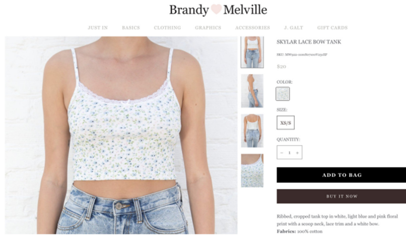
Figure 1. Top sizes on Brandy Melville US website page

A cursory click through several random items brings up largely the same results, with one or two items (all